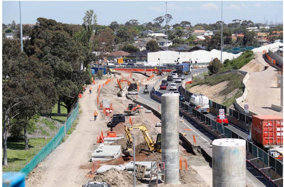
Spring blitz works underway near Williamstown Road