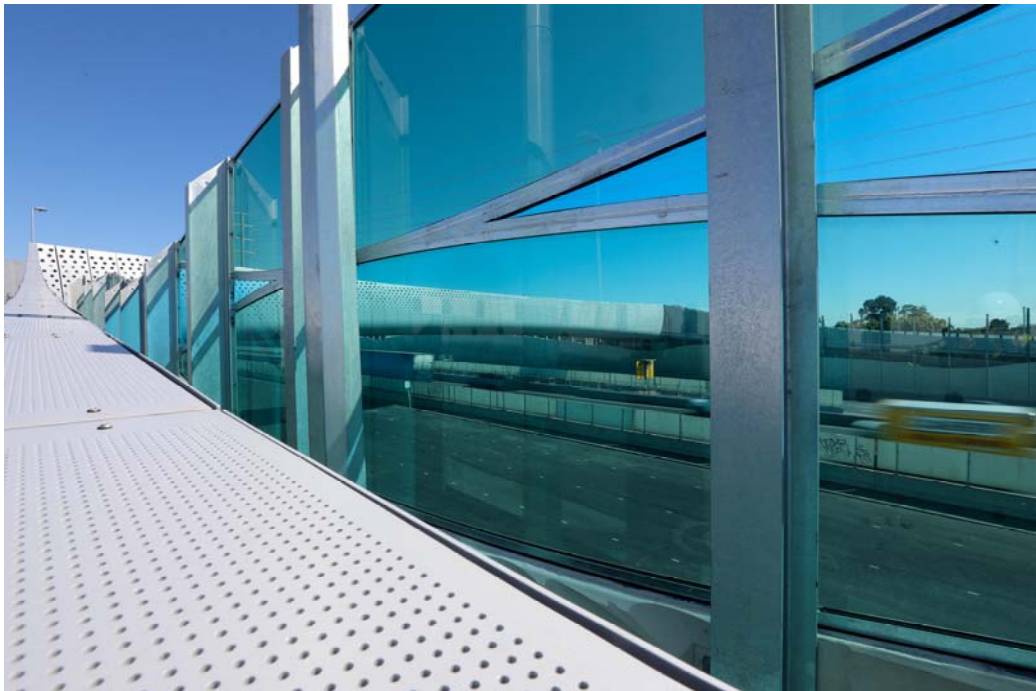
Rosala Pedestrian bridge