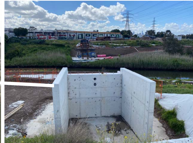
Bridge supports installed for new walking and cycling bridge