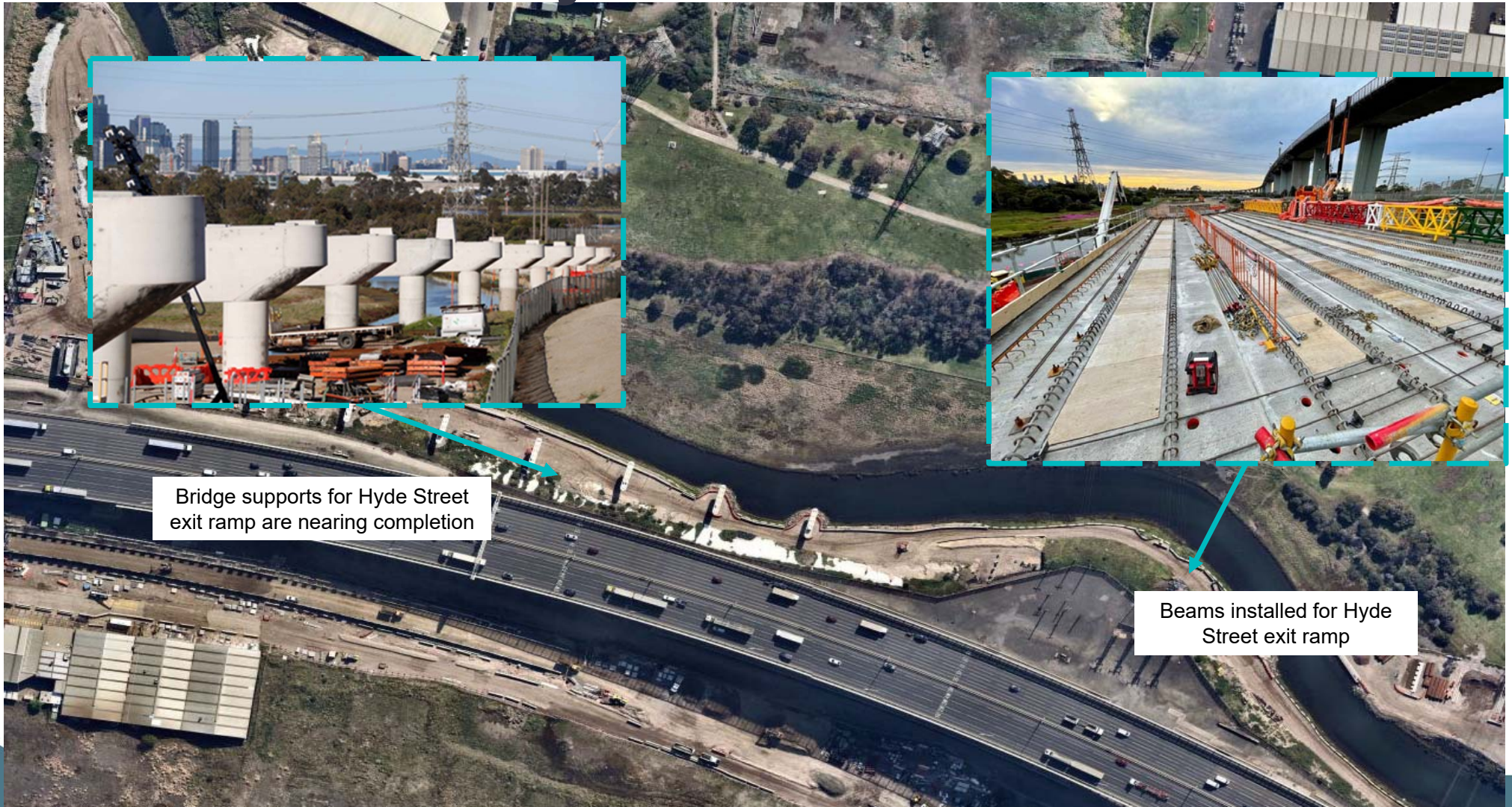
Bridge supports for Hyde Street exit ramp are nearing completion