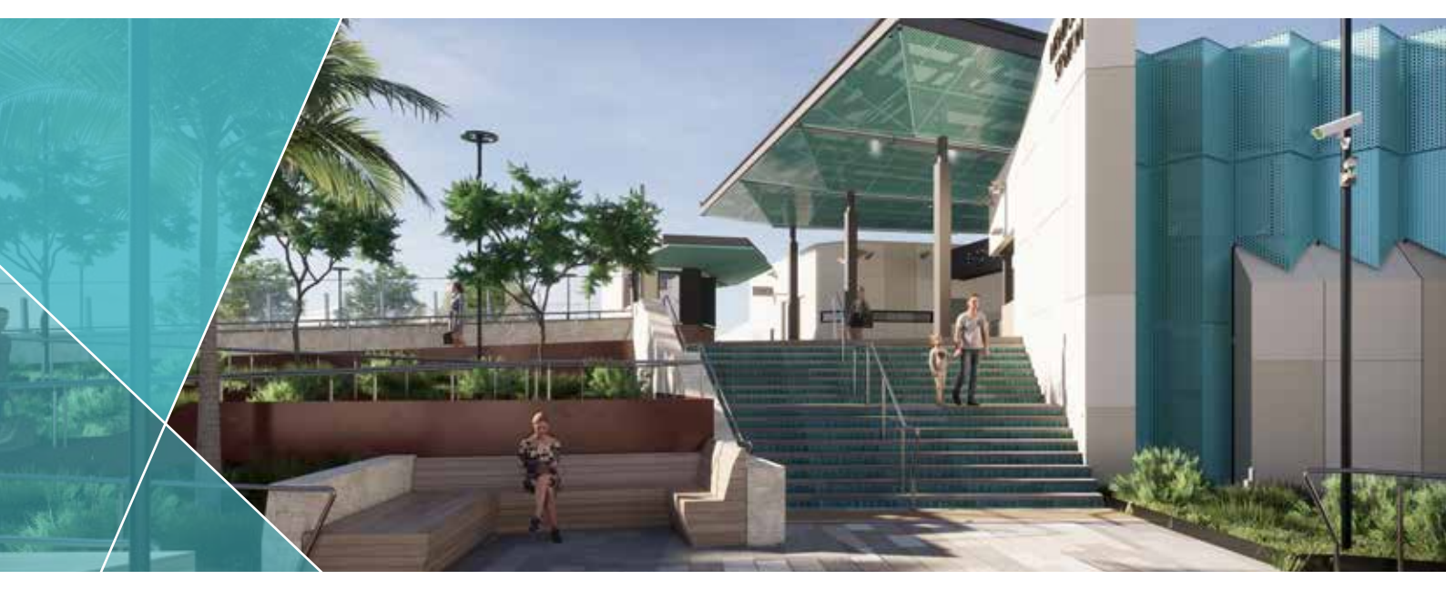
Your new Mentone Station will feature a modern forecourt. Along with the expanded Mentone Station gardens and heritage deck there will be plenty of open space to enjoy. Artist impression only. Subject to change.