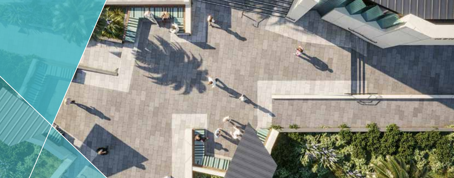
Mentone Station will have a new station forecourt, with modern seating and footpath improvements. Artist impression only. Subject to change.