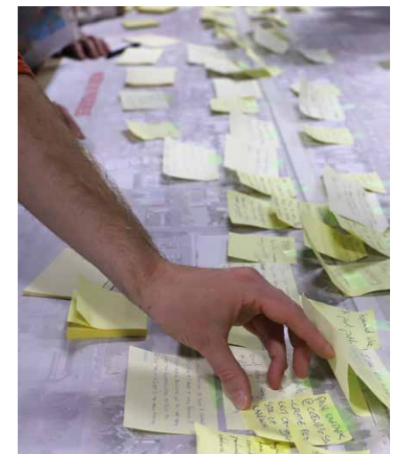
Community feedback will help shape the design

Planning submissions can be made online at bigbuild.engage.vic.gov.au/lxrp-glenroy by 5pm Monday 18 May. If you would like a hard copy submission form sent to you, please contact us on 1800 105 105 or email us at contact@levelcrossings.vic.gov.au