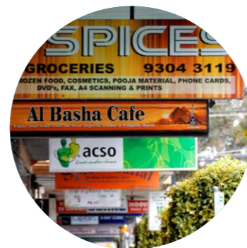
Local traders in Glenroy

Contact us for more information on how you can get involved or how we can work with your business during the project.