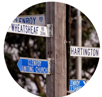
The existing road layout in Glenroy is one constraint of the project

Visit us online at bigbuild.engage.vic.gov.au/lxrp-glenroy to learn more and provide your feedback until Monday 18 May .