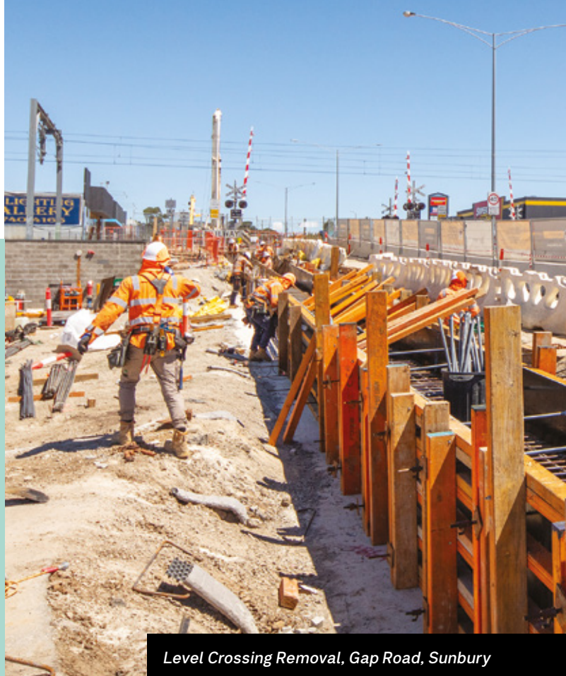
Level Crossing Removal, Gap Road, Sunbury

Work is underway for the future of Sunbury, with major changes coming to your local road and rail network.