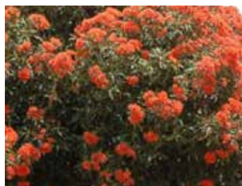
red flowering gum