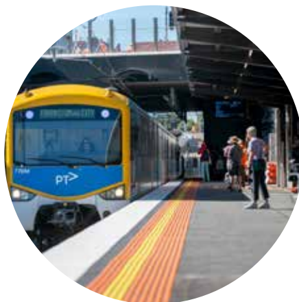
Ferguson Street, Williamstown level crossing removal

When all three level crossings are removed by 2024, the Geelong and Ballarat lines will be level crossing free between Deer Park and the city.