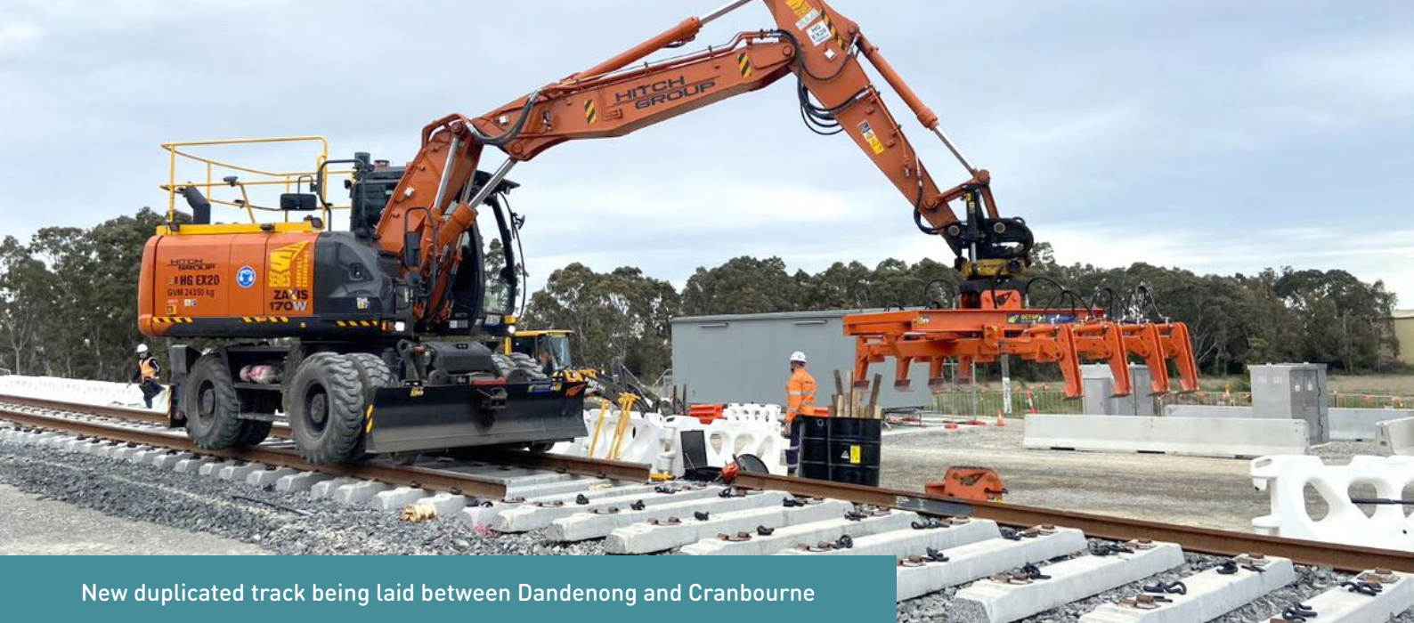
New duplicated track being laid between Dandenong and Cranbourne