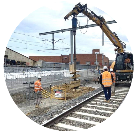
Piling to install overhead structures at Dandenong Station.

While this first phase of works on the Cranbourne line will finish ahead of schedule, major construction and planning continues to remove the remaining level crossings at Camms Road and Webster Street while we also complete other vital works on the line.