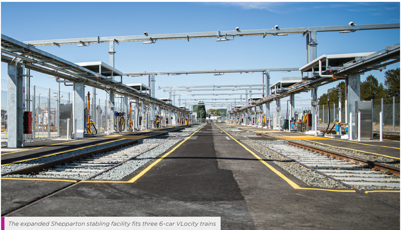
The expanded Shepparton stabling facility fits three 6-car VLocity trains