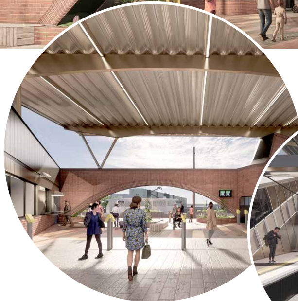
The new Glenhuntly Station. Artist impression, subject to change.