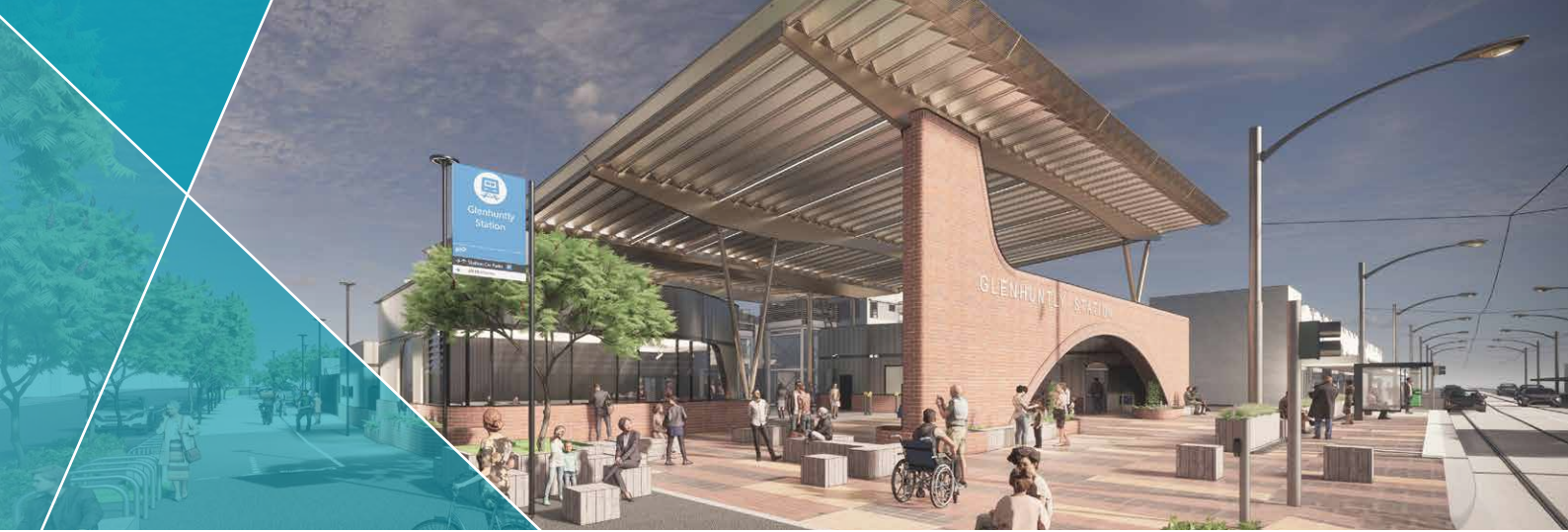
The new Glenhuntly Station. Artist impression, subject to change.