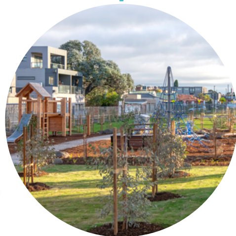
1. Carrum foreshore park 2. Open space off Munro Street in Coburg