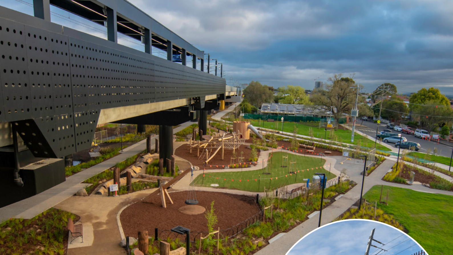
Playground and open space near Moreland station