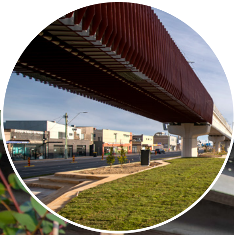
1. Carrum open space 2. New open space and playground near Moreland Station, Coburg

Register your submission by 11.59pm Sunday 12 December.