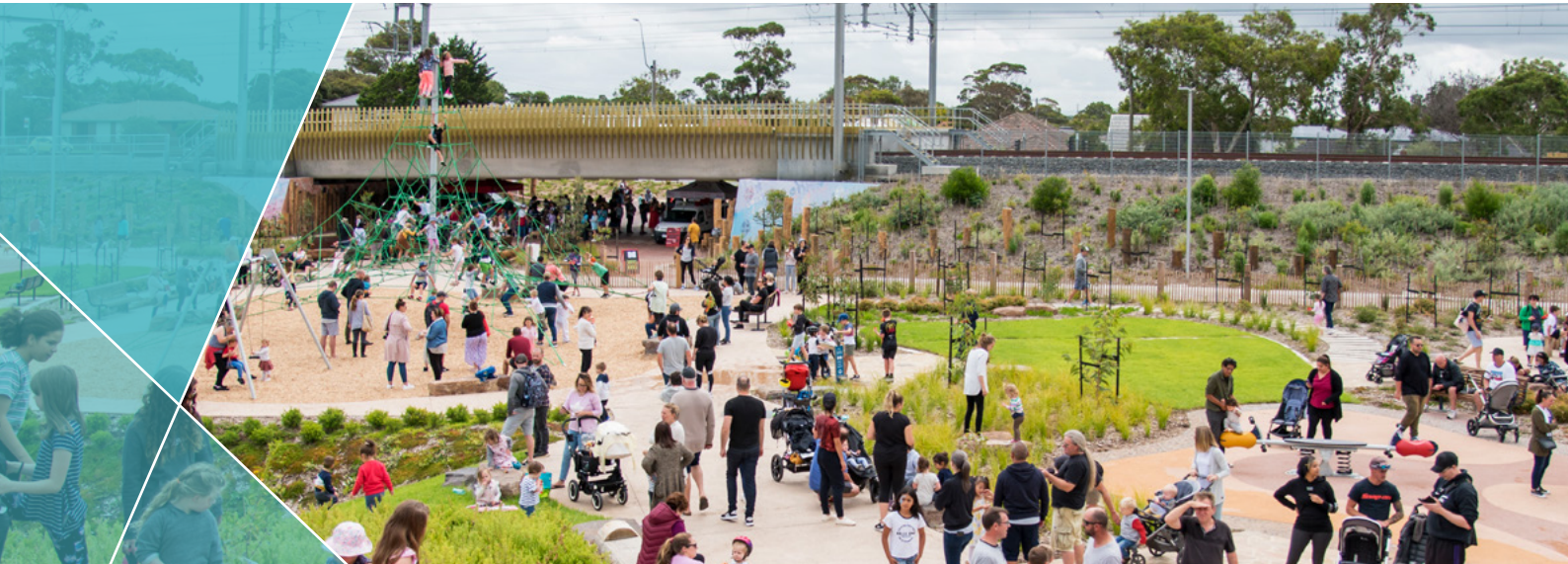
New playground at Seaford Road, Seaford