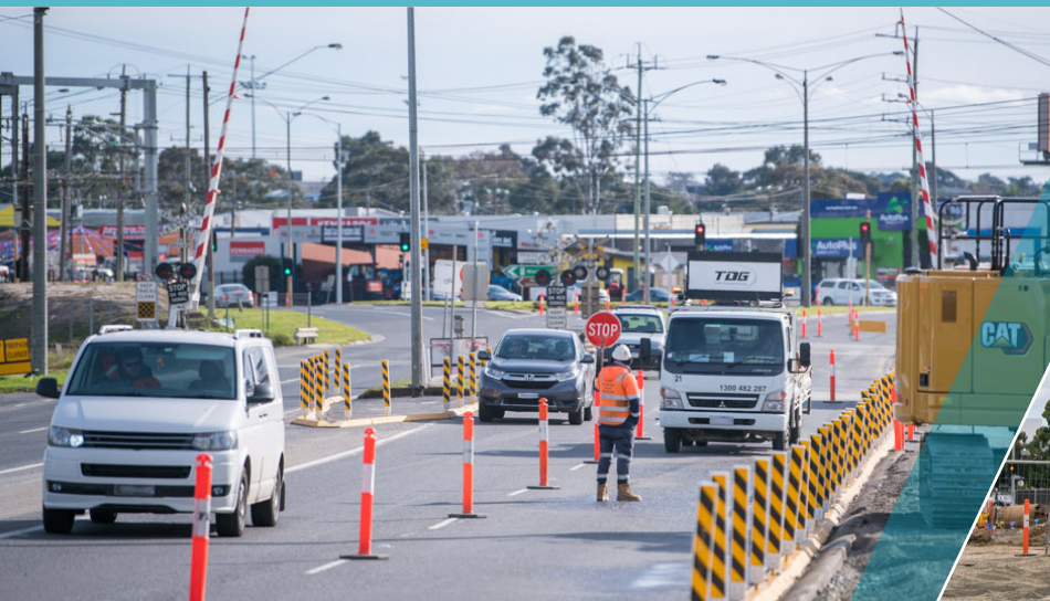
Traffic management to keep you moving safely through the area