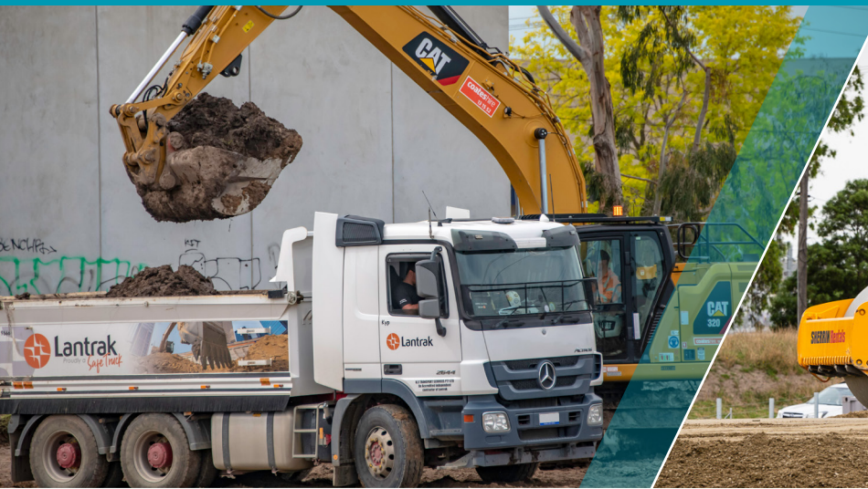
Excavators and trucks moving soil and materials

As works continue you will start to see more construction vehicles around the project site