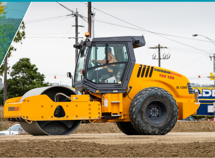
Vibrating rollers creating a firm foundation for us to build the new bridge