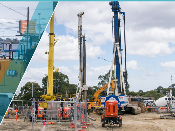
Piling rigs drilling the bridge foundations