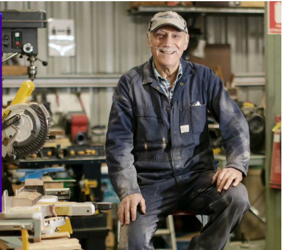
Banyule Men's Shed

For more information, visit northeastlink.vic.gov.au/communityfund