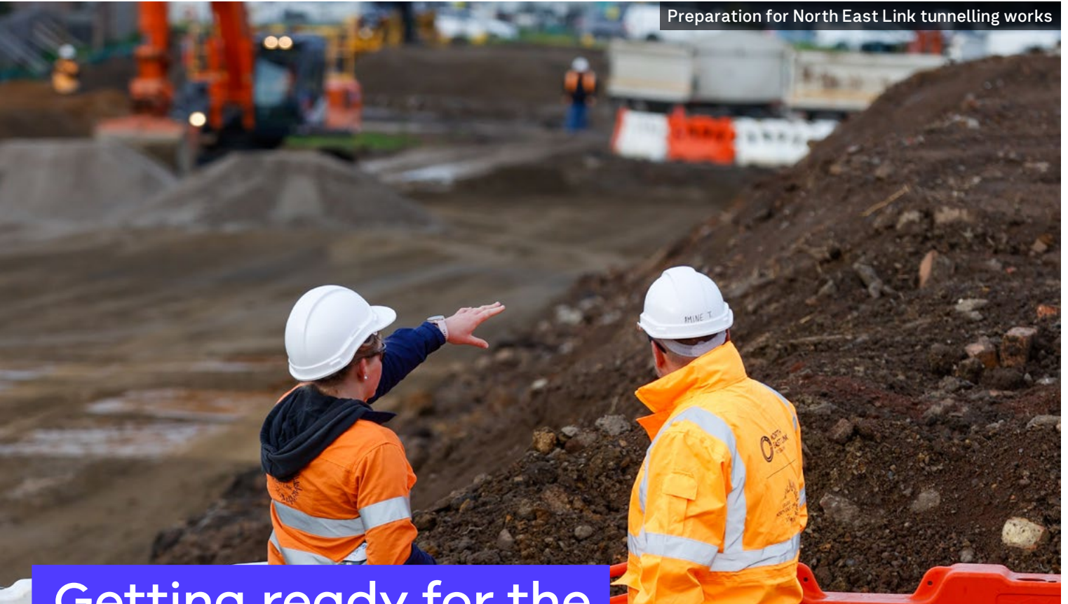
Preparation for North East Link tunnelling works