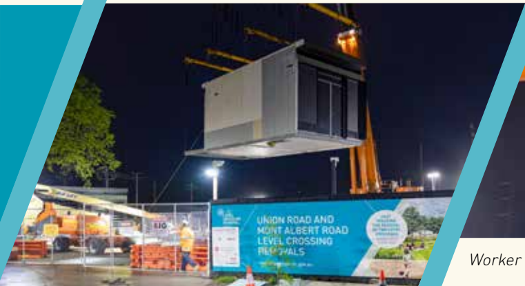
Station building being craned into place