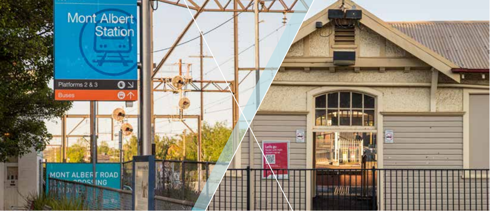
Mont Albert Station