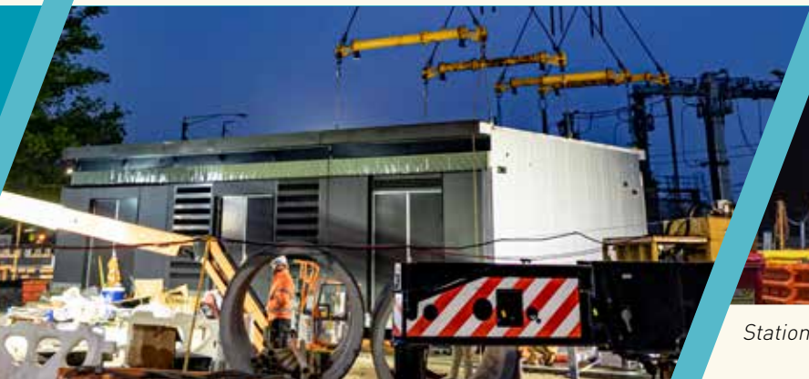
Station building in place