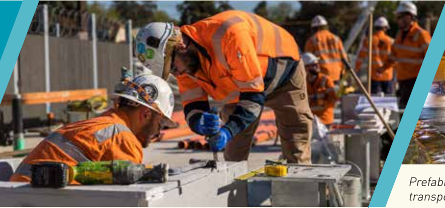
Workers building the foundations for the new prefabricated Union Station buildings