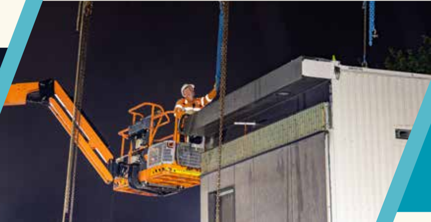
Worker helping to place the station building