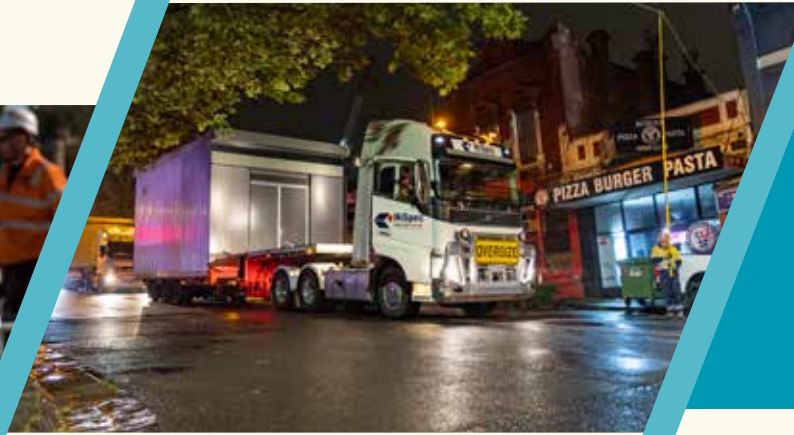
Prefabricated Union Station building is transported to site