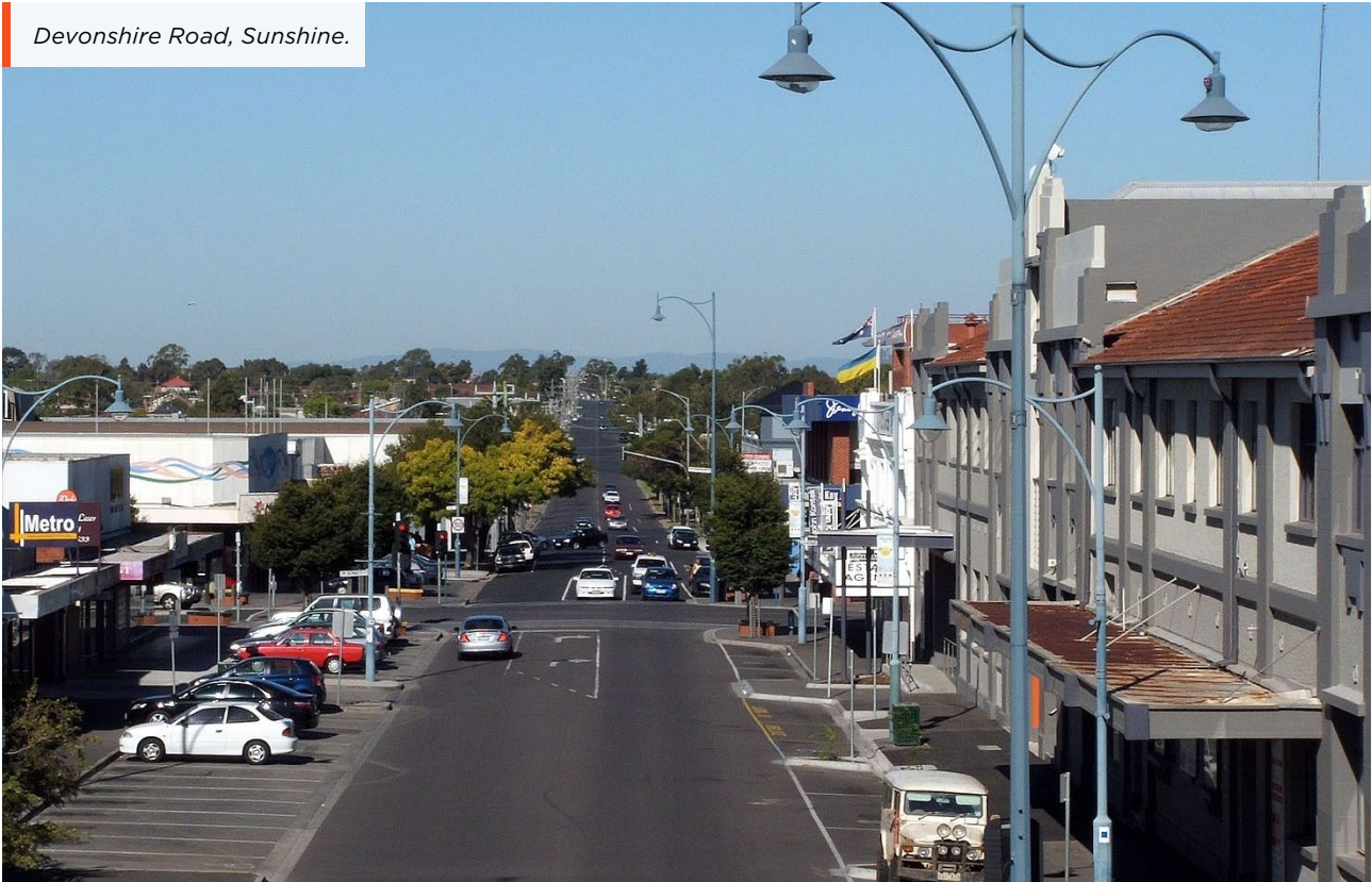
Devonshire Road, Sunshine.