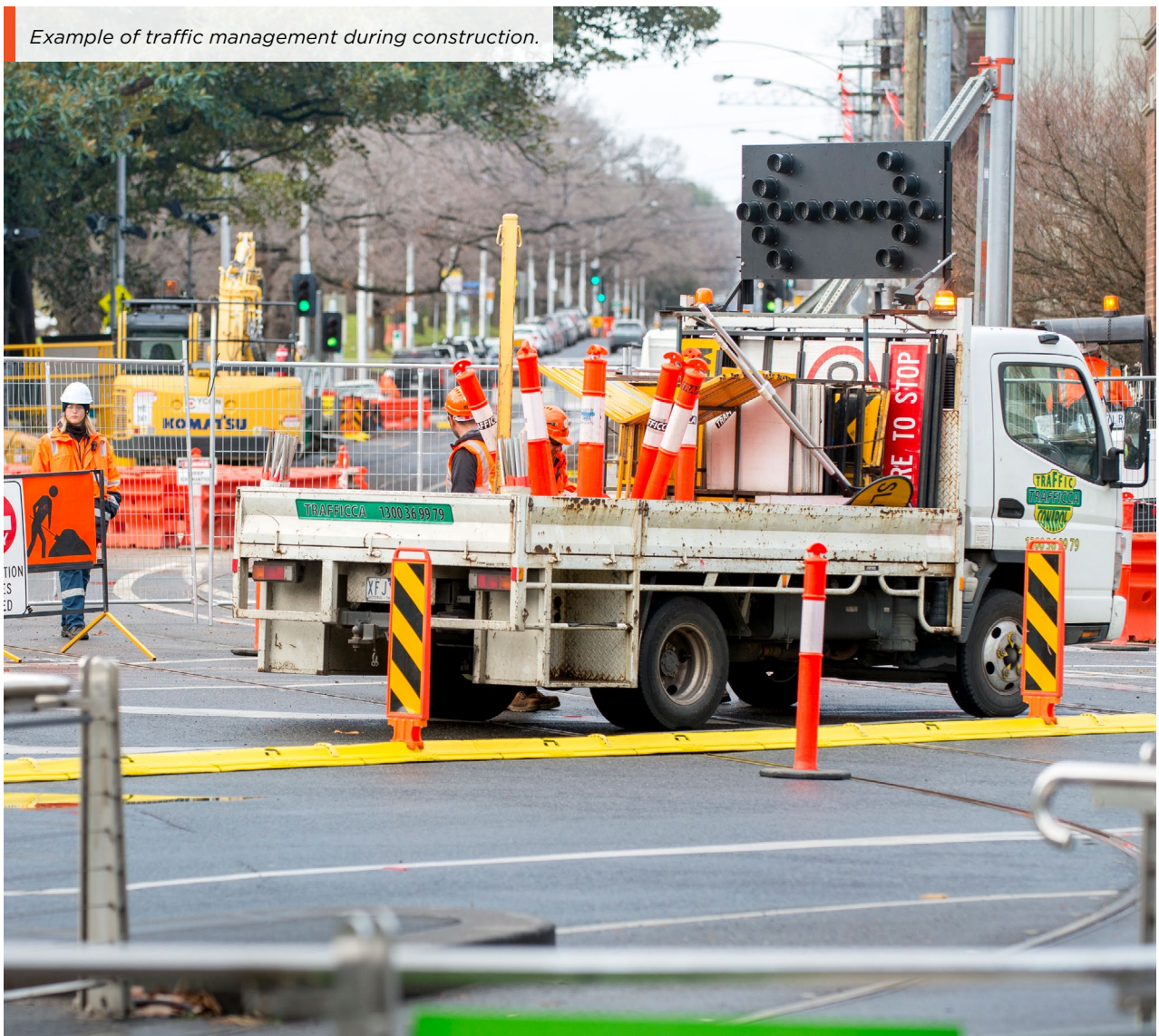
Example of traffic management during construction.

RPV and the appointed contractors will work closely with all landowners when planning for site compound and laydown areas.