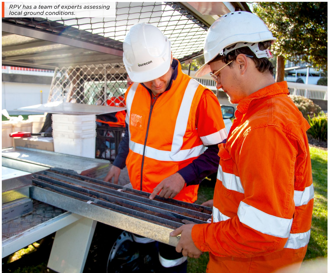
RPV has a team of experts assessing local ground conditions.