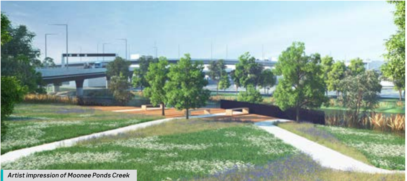
Artist impression of Moonee Ponds Creek