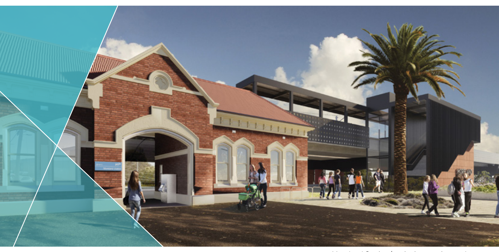
Moreland Station | artist impressions only

The Victorian Government is removing the dangerous and congested level crossings at Bell Street, Reynard Street and Munro Street in Coburg, and Moreland Road in Brunswick.