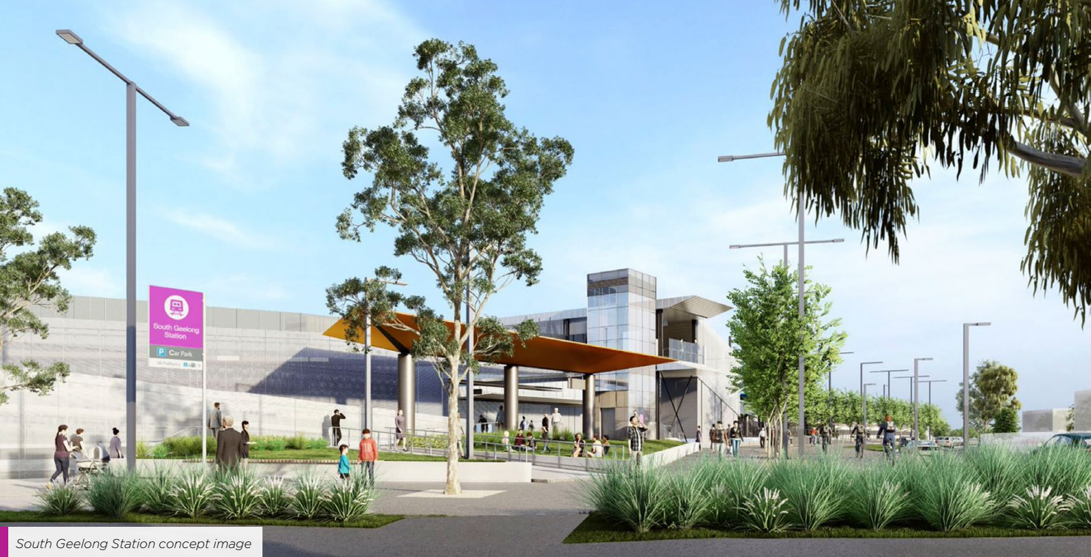
South Geelong Station concept image