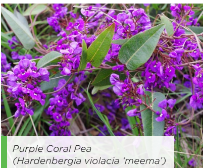
Purple Coral Pea ( Hardenbergia violacea 'meema')