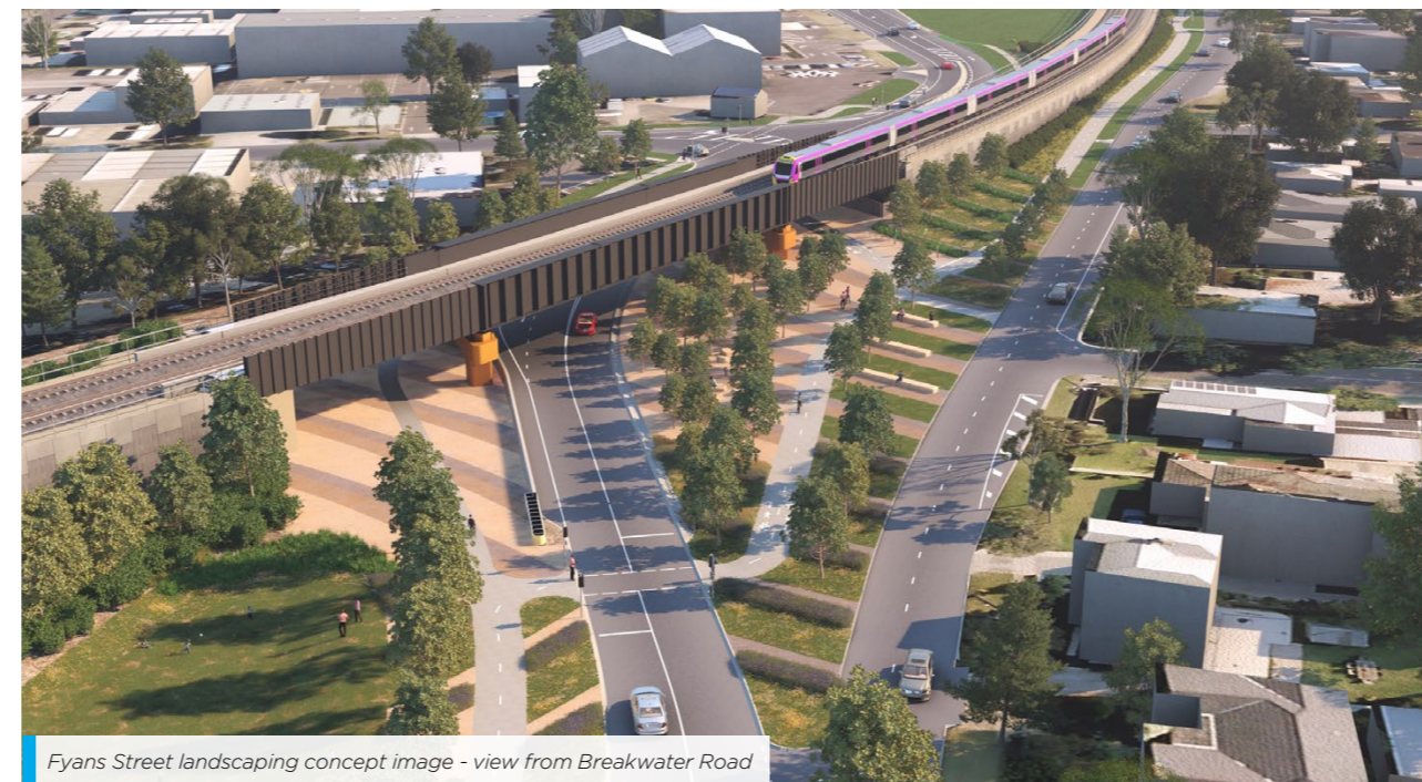
Fyans Street landscaping concept image - view from Breakwater Road