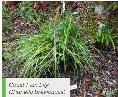
Coast Flax Lily ( Dianella brevicaulis )