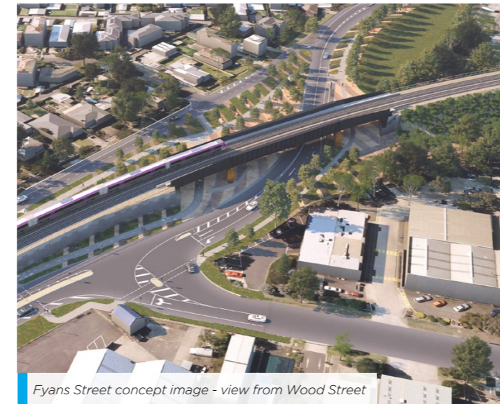
Fyans Street concept image - view from Wood Street

Replanting along Strong Street in South Geelong will also enhance this stretch of the rail line.