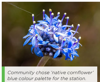
Community chose 'native cornflower' blue colour palette for the station.