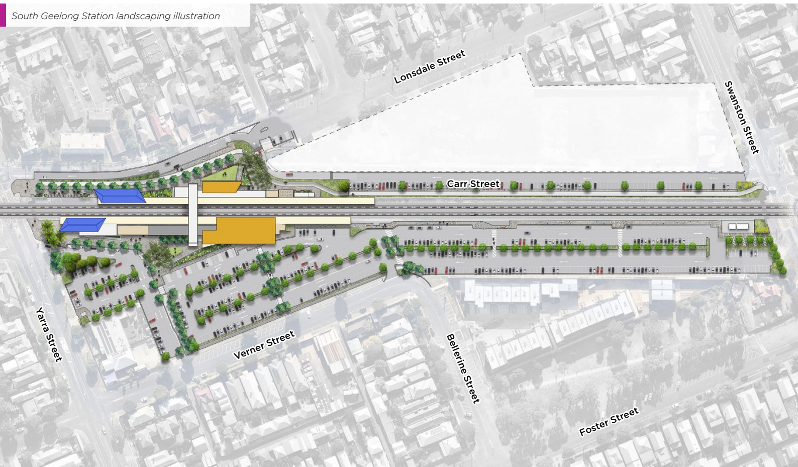
South Geelong Station landscaping illustration

Car parks can create challenging environments for many tree species to survive. The native trees selected for the car park will maximise canopy and shading and grow to a healthy size.