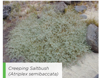
Creeping Saltbush ( Atriplex semibaccata )