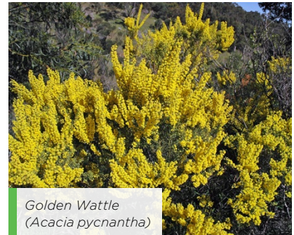
Golden Wattle ( Acacia pycnantha )