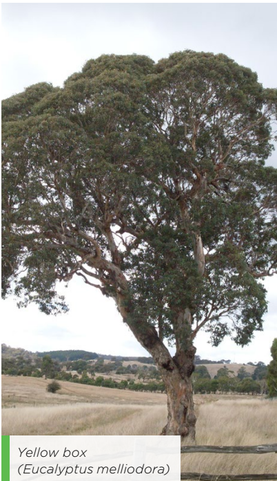
Yellow box ( Eucalyptus melliodora )

Tree planting and landscaping will occur as soon as construction is complete on the project. Where possible, we will plant semi-established trees to provide immediate screening and habitat benefits. Some example species that will be used in the landscaping around the South Geelong Station and Fyans Street precincts can be seen below.