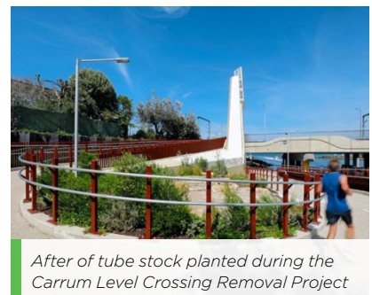
After of tube stock planted during the Carrum Level Crossing Removal Project