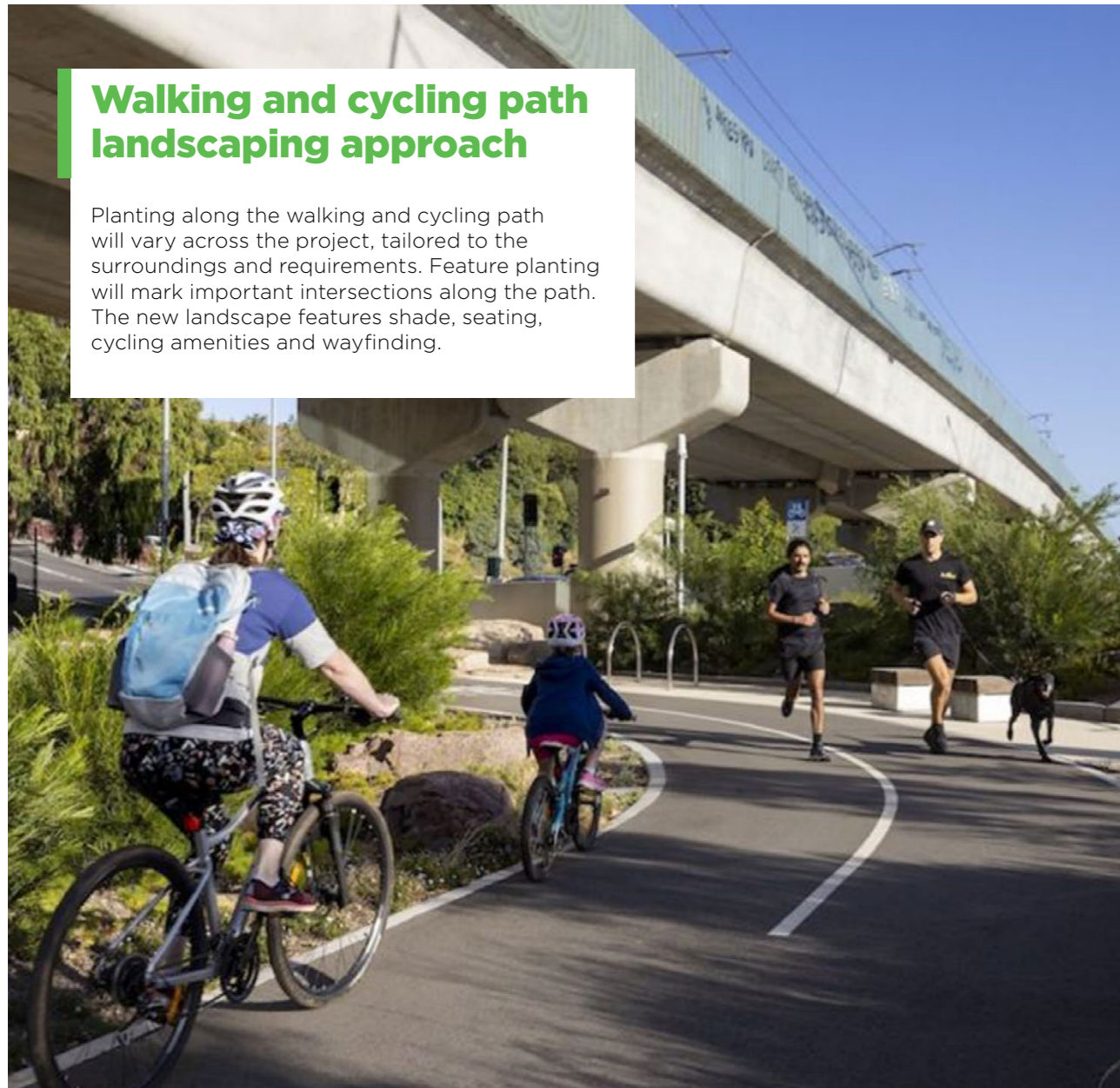
Example of landscaped walking and cycling path (image of the Toorak Road level crossing removal and shared user path https://bigbuild.vic.gov.au/projects/level-crossing-removal-project/projects/toorak-road-kooyong )

Planting along the walking and cycling path will vary across the project, tailored to the surroundings and requirements. Feature planting will mark important intersections along the path. The new landscape features shade, seating, cycling amenities and wayfinding.