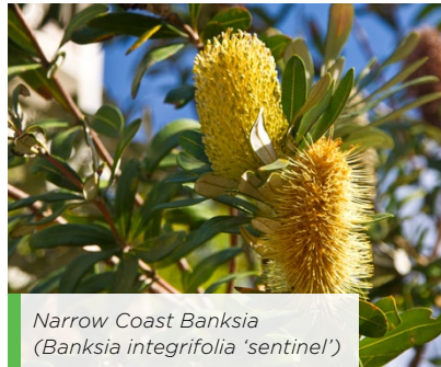
Narrow Coast Banksia ( Banksia integrifolia 'sentinel')