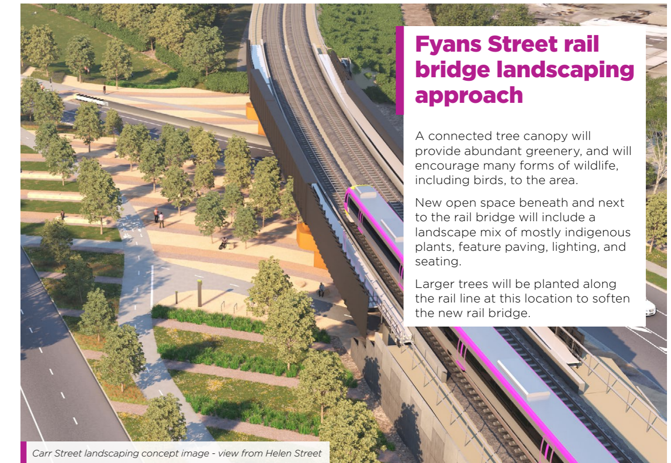
Carr Street landscaping concept image - view from Helen Street

Larger trees will be planted along the rail line at this location to soften the new rail bridge.