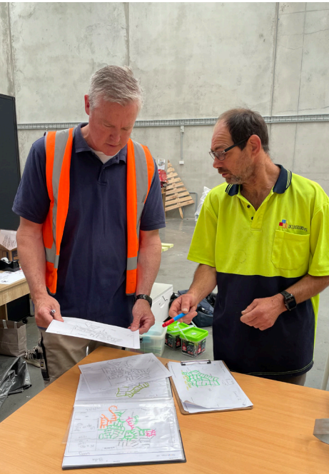
Image: Distinctive Options are one of our key partners in delivering the project.

To date, Distinctive Options has delivered 100,000 project newsletters to the community.