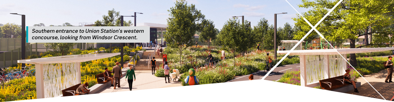
Southern entrance to Union Station's western concourse, looking from Windsor Crescent.