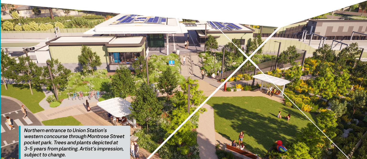
Northern entrance to Union Station's western concourse through Montrose Street pocket park. Trees and plants depicted at 3-5 years from planting. Artist's impression, subject to change.

Our designers have drawn on this feedback during the process of refining and finalising the landscaping and open space designs.