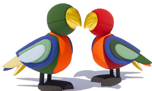
King Parrot sculptures. Artist's impression, subject to change.