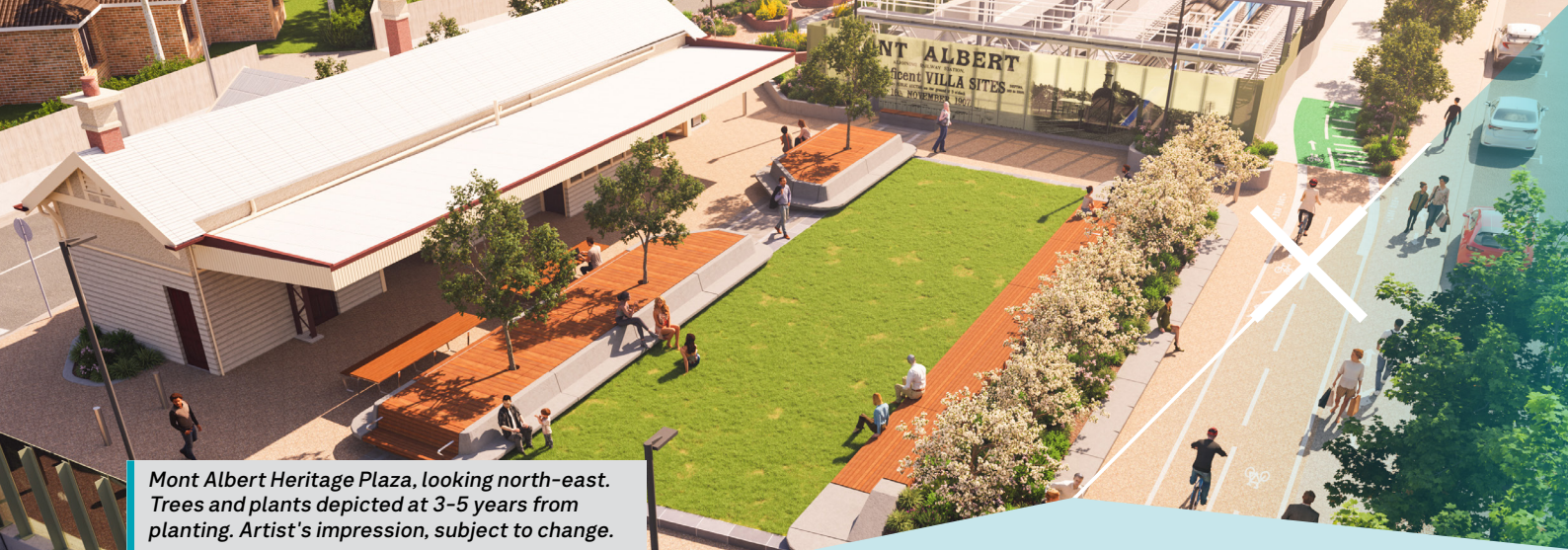
Mont Albert Heritage Plaza, looking north-east. Trees and plants depicted at 3-5 years from planting. Artist's impression, subject to change.