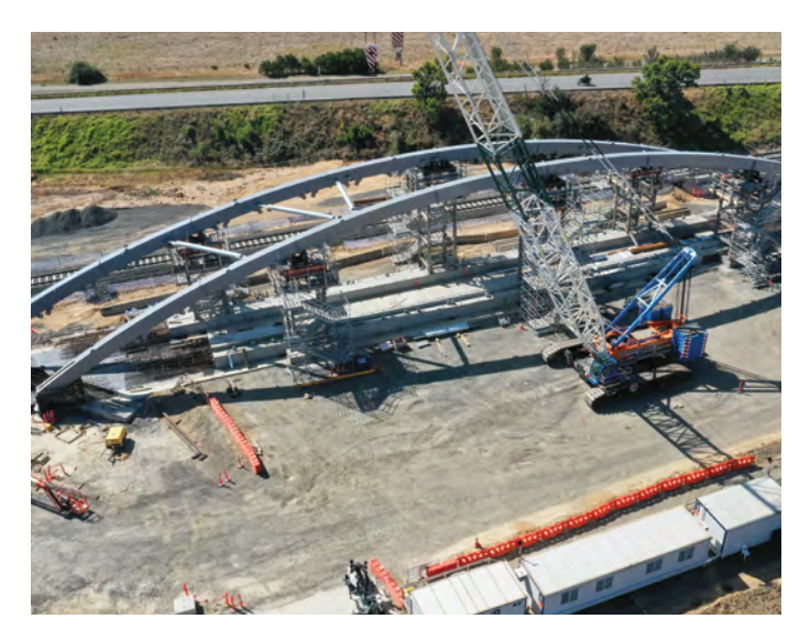
The new rail bridge is taking shape with all arch segments now in place! Make sure to check it out.