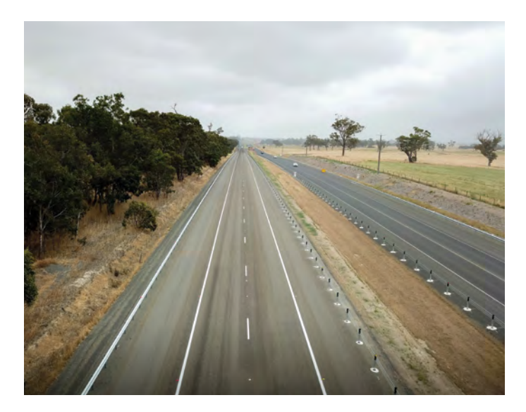
Traffic is now flowing in both directions on the newly constructed lanes between Sheepwash Creek and Flynns Creek roads.