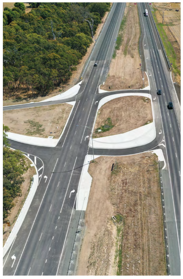
The upgraded intersections at Barrs and Stuckeys lanes are now open, providing safer access for locals and better travel times for all motorists.