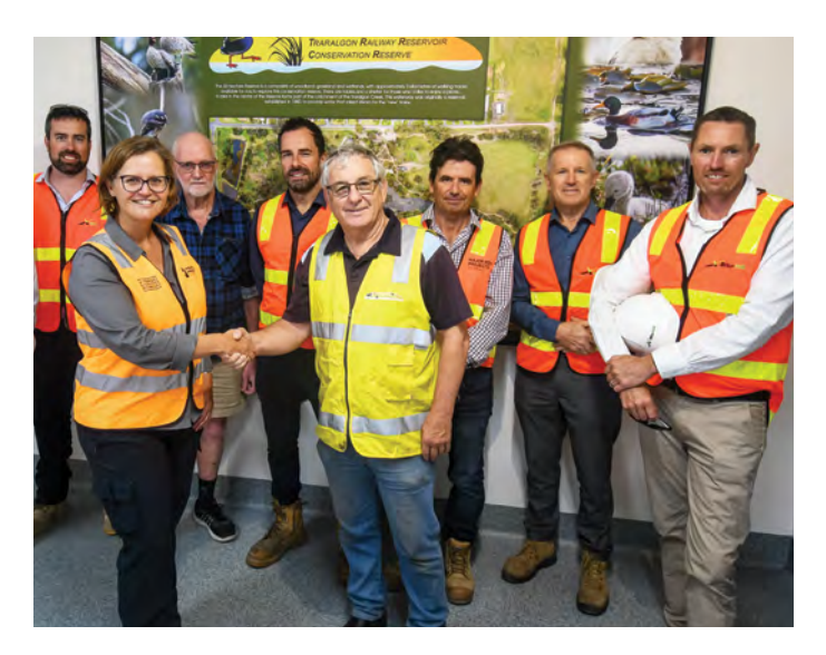
As part of the upgrade, we've donated 165 tonnes of crushed rock to the Traralgon Railway Reservoir Conservation Reserve to help them build safer walking and cycling paths.