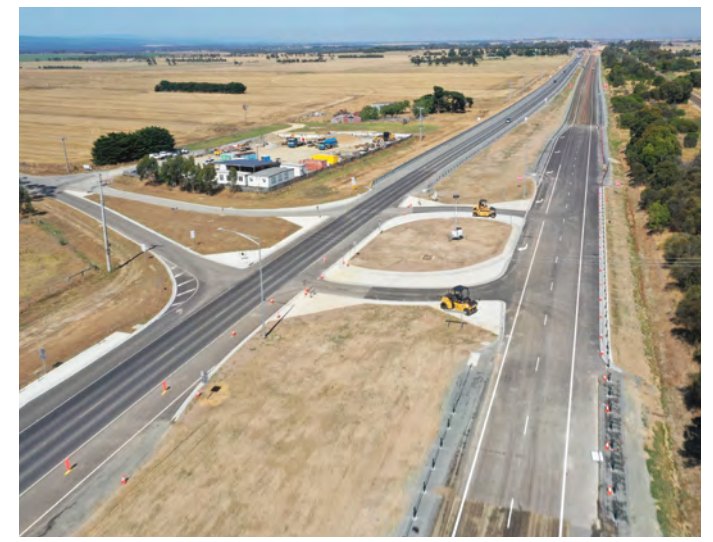
We've completed a new, safer intersection at Templetons Road which is now open for your use!