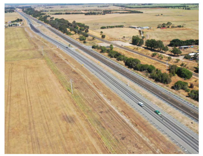
The Highway upgrade between Velore Road and Sale-Cowwarr Road in Kilmany is now complete, providing you with two new lanes in each direction.