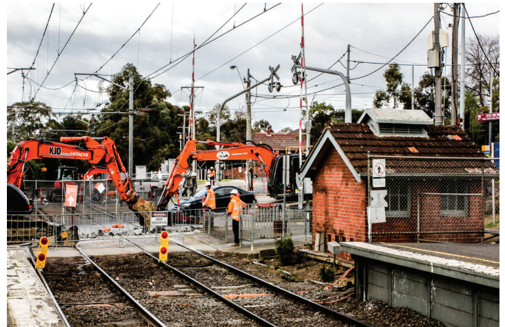
Construction at Burke Road and Gardiner Station