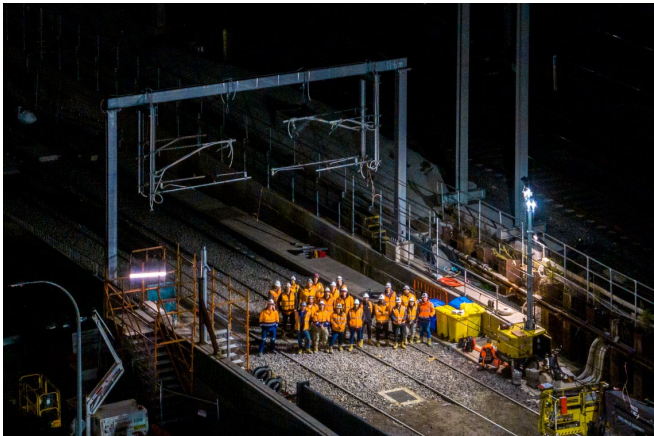
Rail Tunnel Fitout