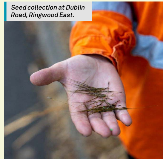
Seed collection at Dublin Road, Ringwood East.

We'll work to retain as many trees as possible and will plant around 60,000 new trees, shrubs and grasses as part of the project.