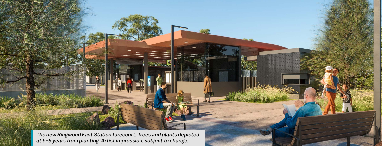
The new Ringwood East Station forecourt. Trees and plants depicted at 5-6 years from planting. Artist impression, subject to change.