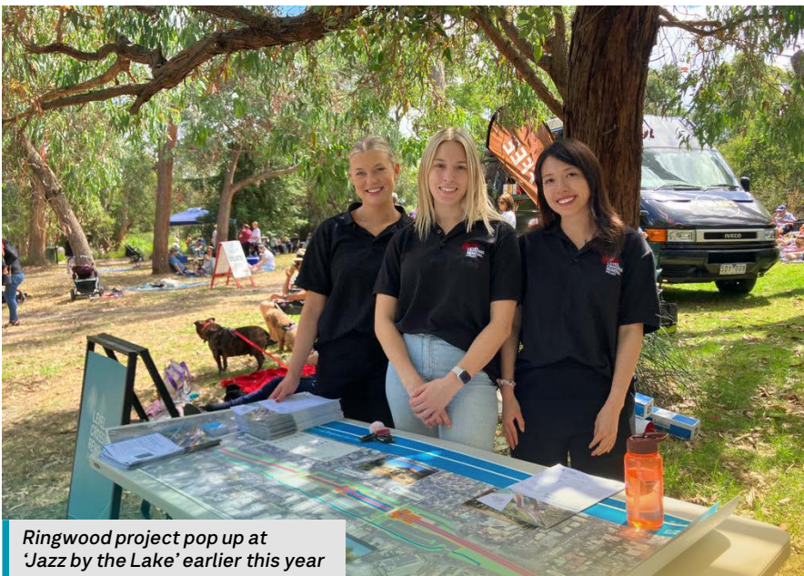
Ringwood project pop up at 'Jazz by the Lake' earlier this year

Thank you to locals for stopping by and having a chat with our team, whether it's been at the station, at the shops or at an event. We look forward to meeting more of you and encourage you to say hi the next time you see us!