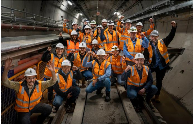
Rail Tunnel Fitout