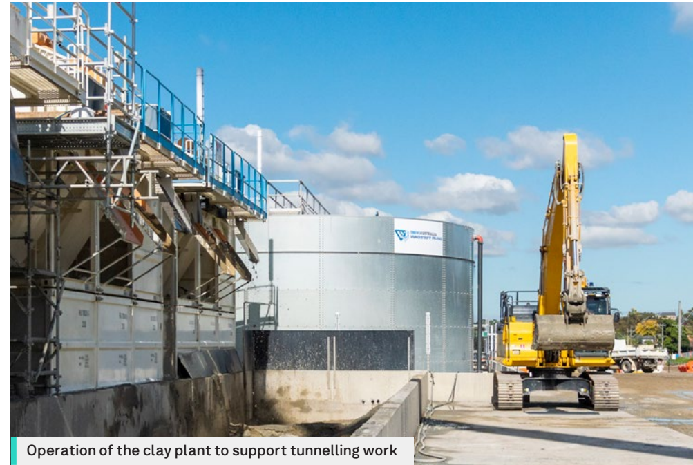
Operation of the clay plant to support tunnelling work