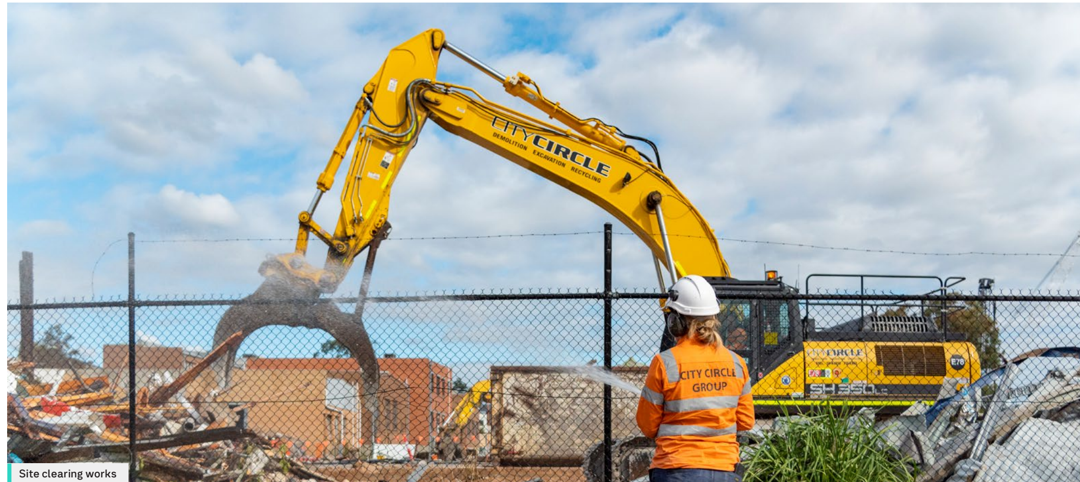
Site clearing works