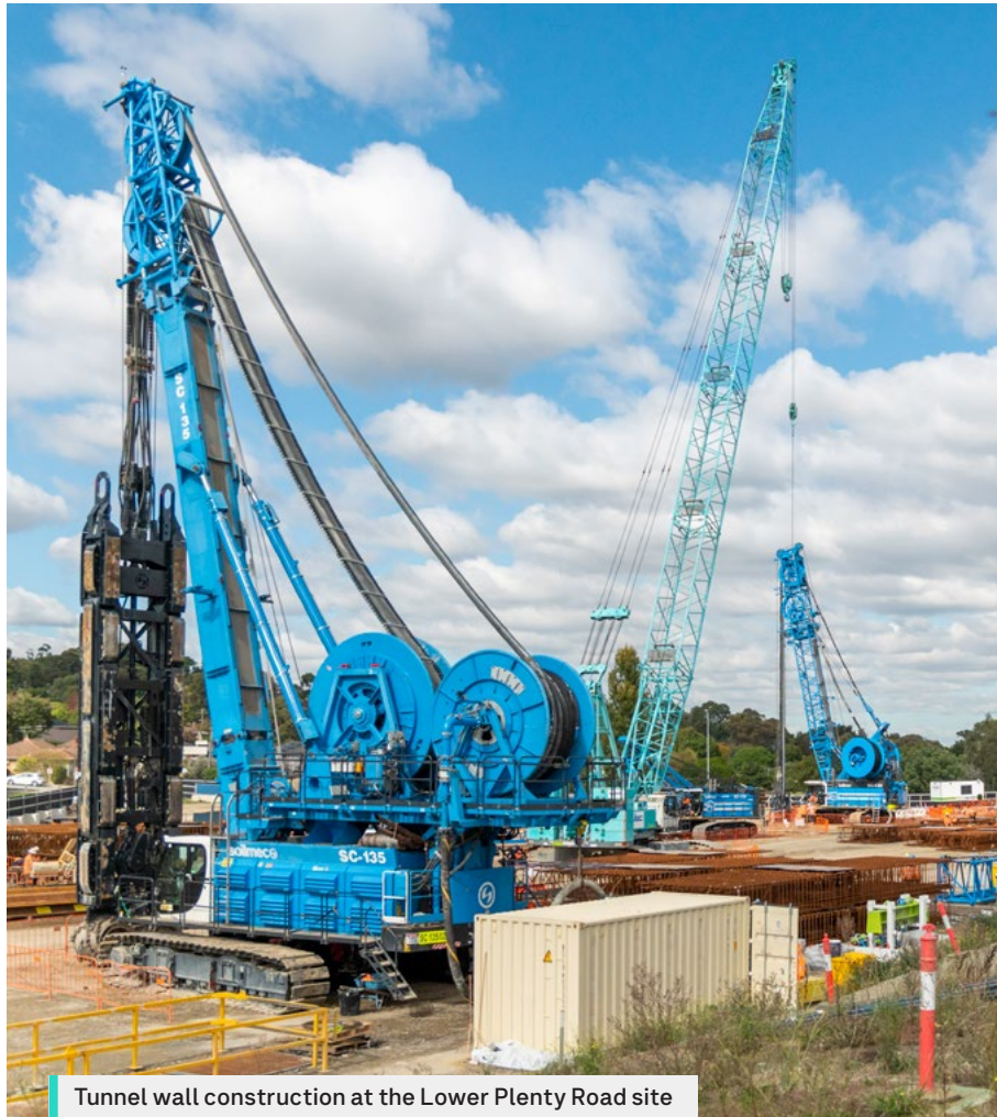
Tunnel wall construction at the Lower Plenty Road site