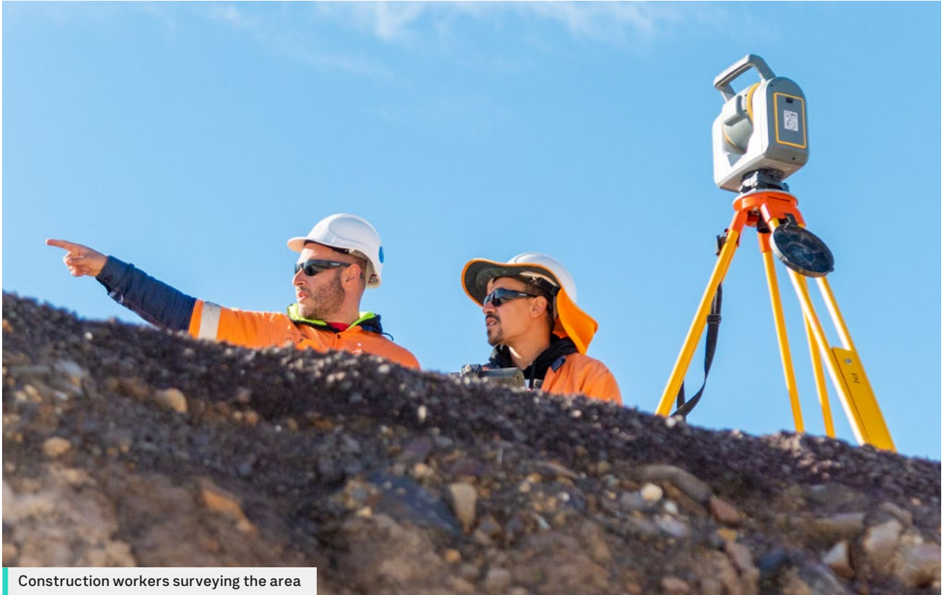
Construction workers surveying the area