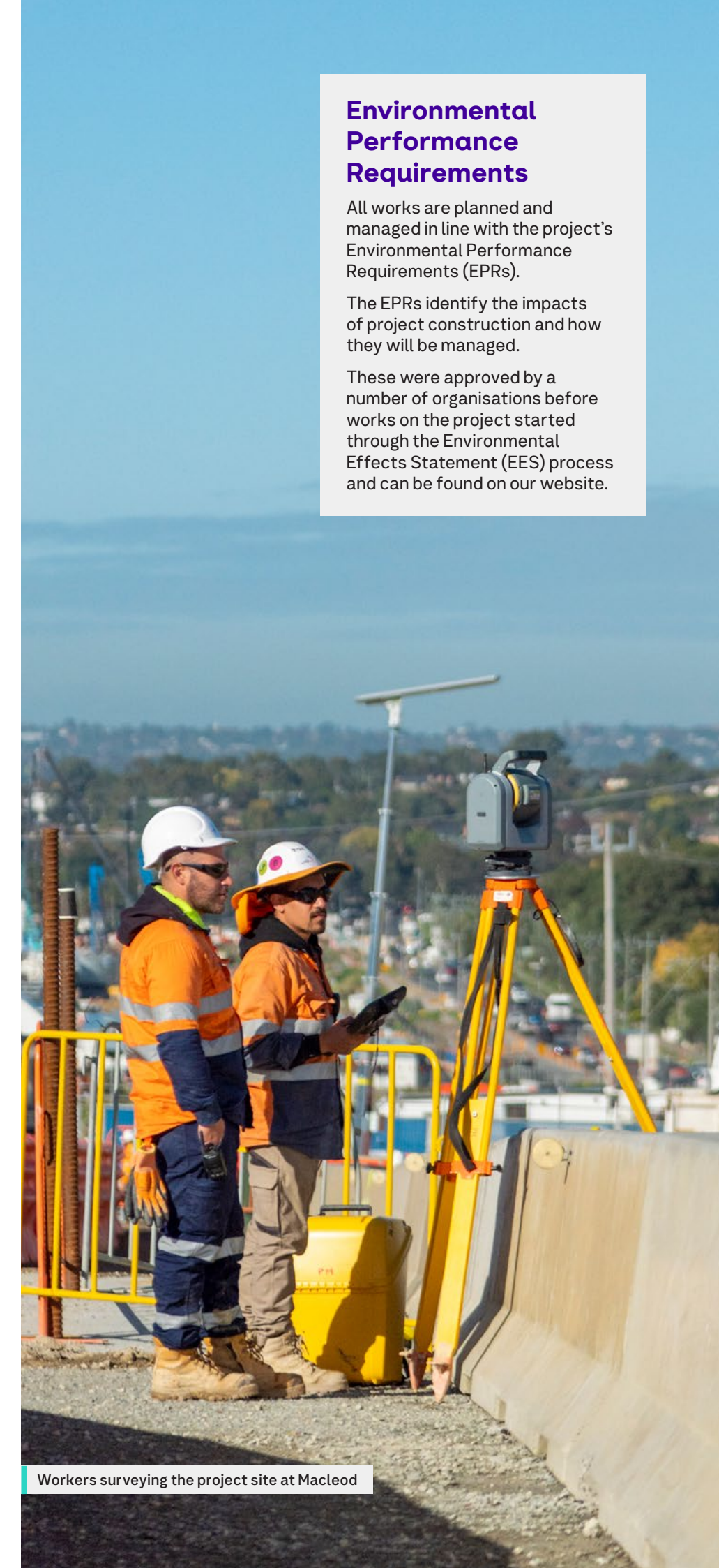
Workers surveying the project site at Macleod

These were approved by a number of organisations before works on the project started through the Environmental Effects Statement (EES) process and can be found on our website.