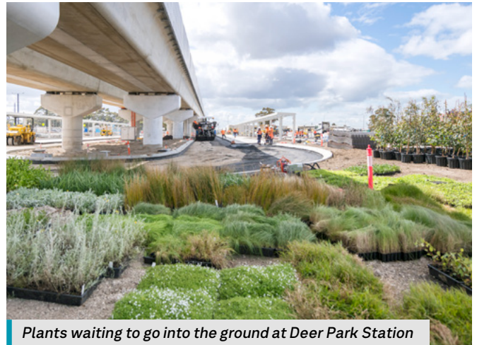
Plants waiting to go into the ground at Deer Park Station