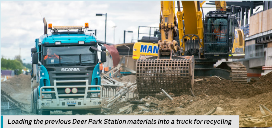
Loading the previous Deer Park Station materials into a truck for recycling

To build the new rail bridge and station, crews demolished the previous station and excavated the site to lay foundations and locate underground services. More than 80% of the construction waste and excavated material, mostly asphalt, concrete and steel, was sent to an industrial recycler where it has been processed for reuse on other construction projects.