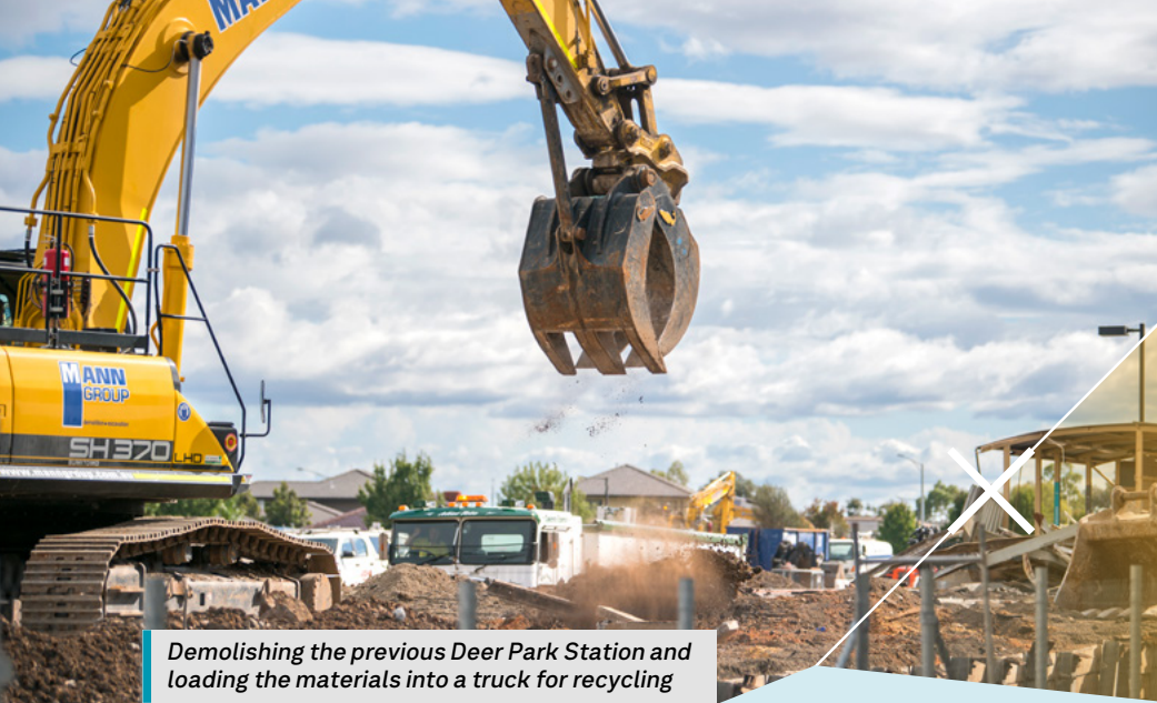
Demolishing the previous Deer Park Station and loading the materials into a truck for recycling