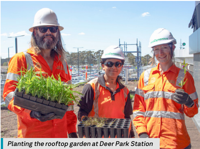
Planting the rooftop garden at Deer Park Station

More than 50,000 native trees, shrubs and grasses will have been planted in the Deer Park Station precinct when works are completed.