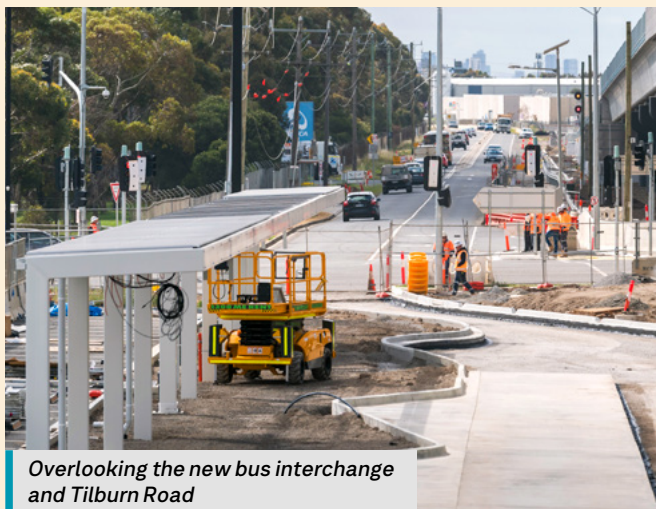
Overlooking the new bus interchange and Tilburn Road