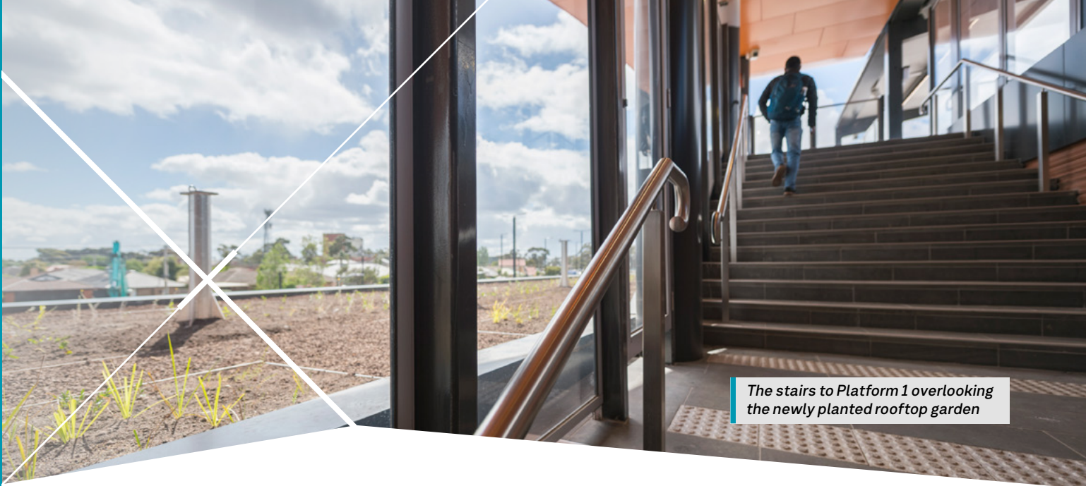
The stairs to Platform 1 overlooking the newly planted rooftop garden

Mt Derrimut Road, Deer Park and Derrimut / Issue #6, December 2023