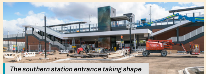
The southern station entrance taking shape