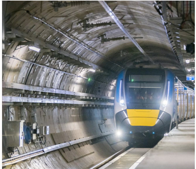
The first test train entering the Metro Tunnel, July 2023

24 hour works are sometimes required during peak construction activities