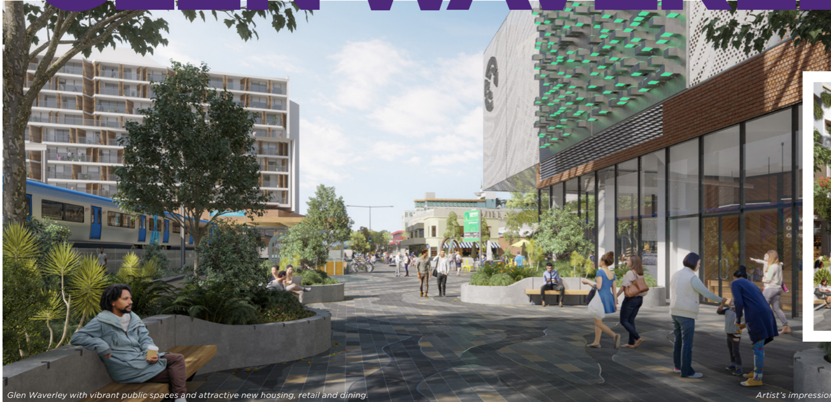
Glen Waverley with vibrant public spaces and attractive new housing, retail and dining.