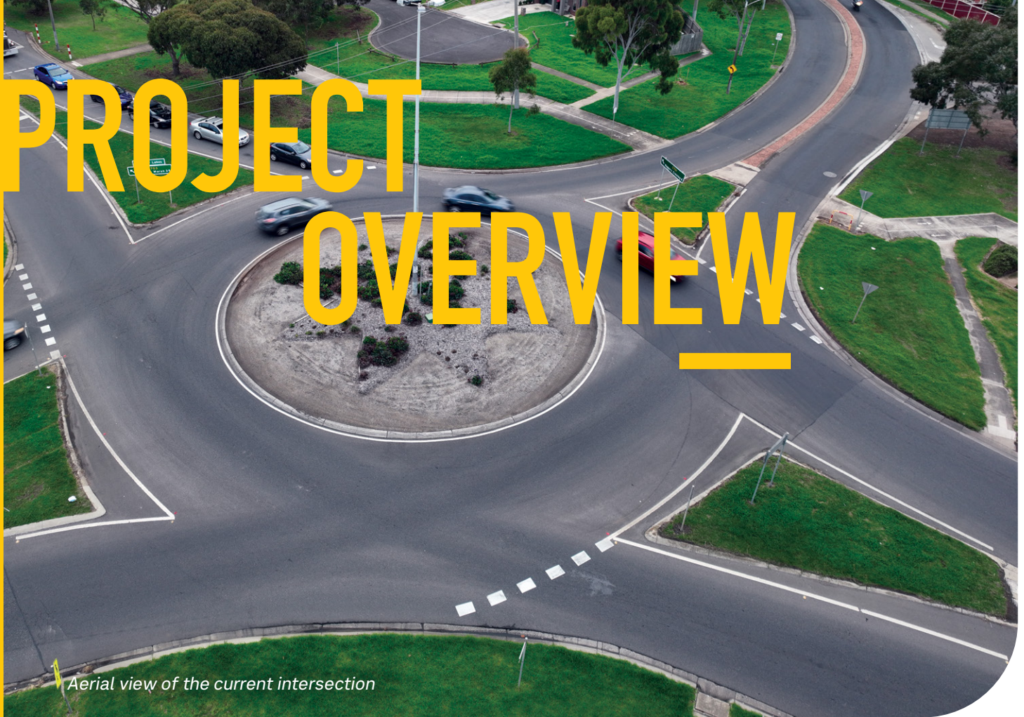
Aerial view of the current intersection