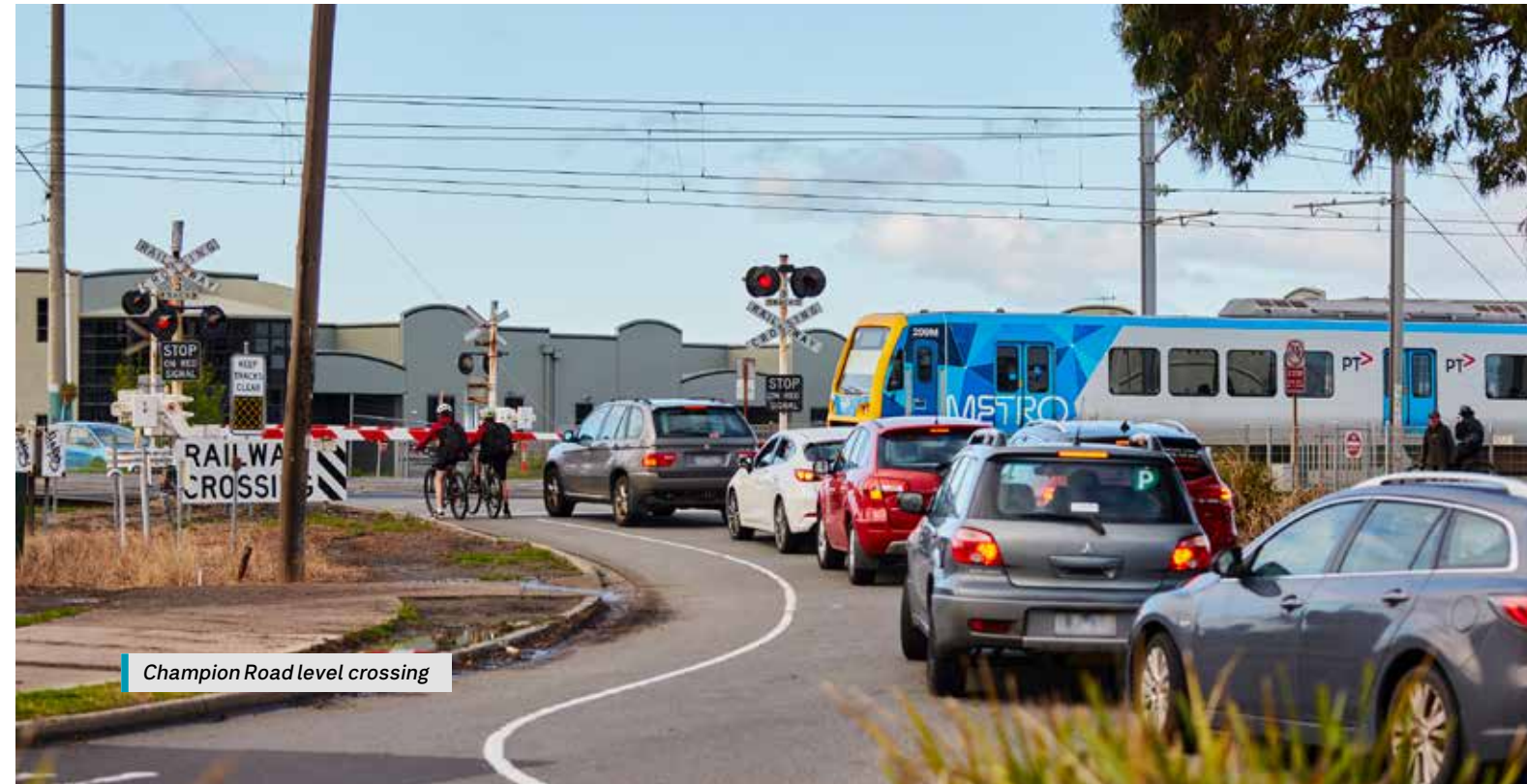
Champion Road level crossing

This new connection will meet modern standards and be accessible for everyone in the community, allowing more space for those with mobility aids, prams and bicycles to cross the rail line. We'll also build a shared walking and cycling path on Railway Parade connecting into the existing path on Market Street, making it safer for people to move around the area.