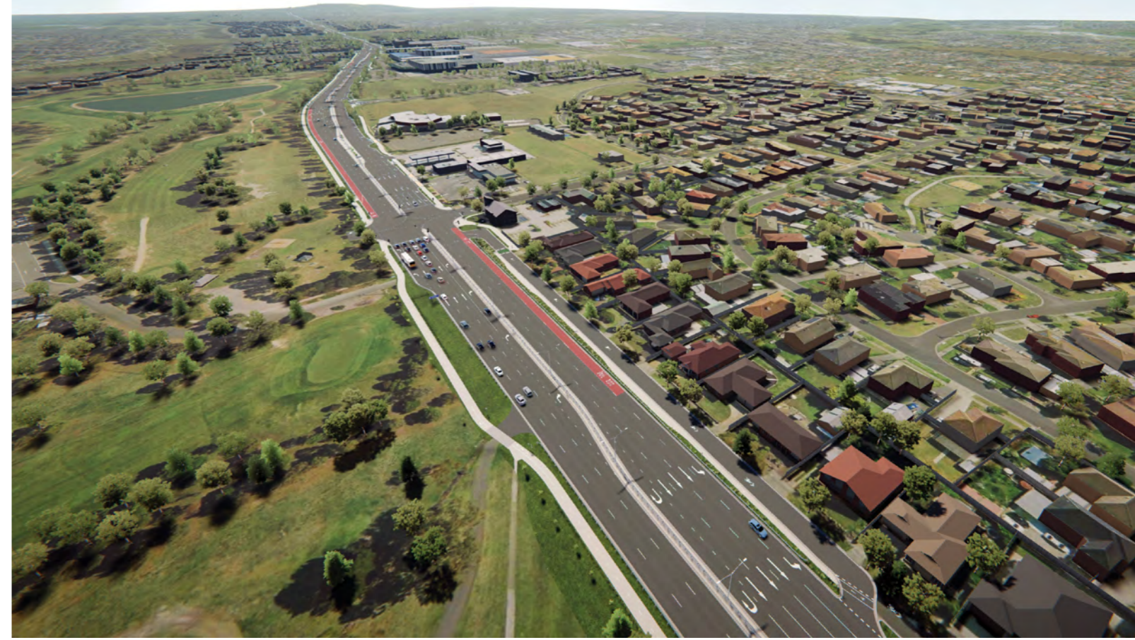
Image right: Artist's impression of the upgraded Craigieburn Road between Cimberwood Drive and Dorchester Street

McDonalds, Craigieburn Shops (7Eleven, Red Rooster, Manoush, Papa Johns, Alakram Restaurant, Taste of Amritsar) and the Craigieburn Health Service are all still open for business, so please support your local traders by shopping and eating local!