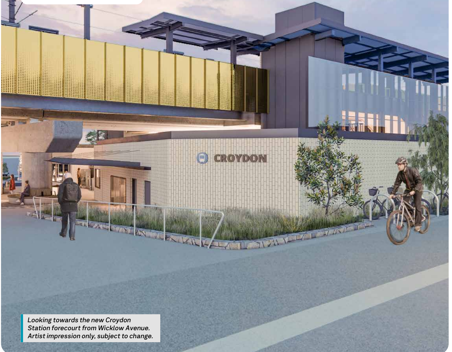
Looking towards the new Croydon Station forecourt from Wicklow Avenue. Artist impression only, subject to change.