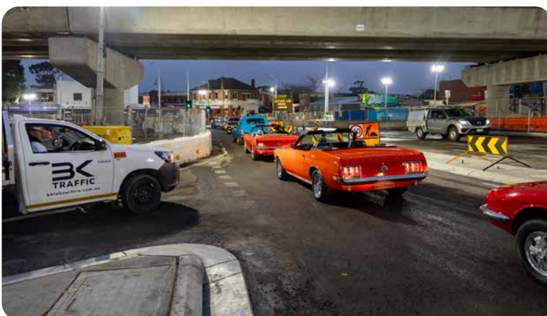
Cars travelling over the new Kent Avenue to Lacey Street connection