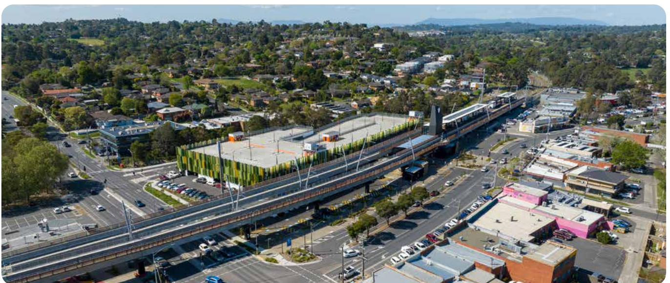
Manchester Road level crossing removal and Mooroolbark Station