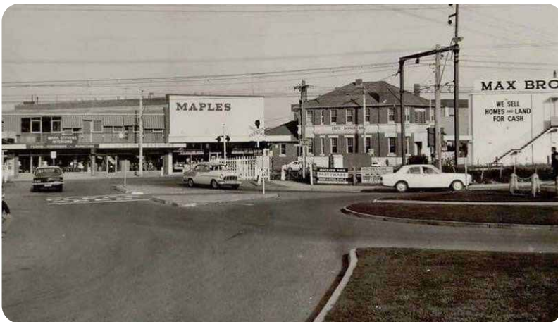
Kent Avenue level crossing

Works will continue into spring on the new Devon Street to Wicklow Avenue and Coolstore Road to Main Street road connections.