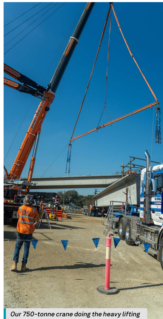
Our 750-tonne crane doing the heavy lifting