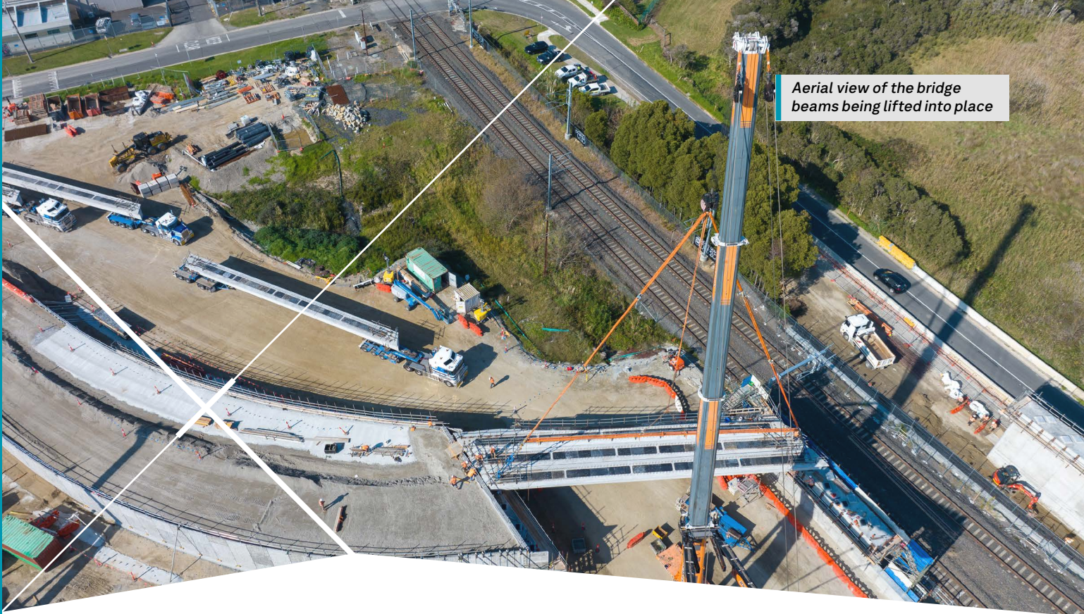
Aerial view of the bridge beams being lifted into place

Station Street, Beaconsfield / August 2024