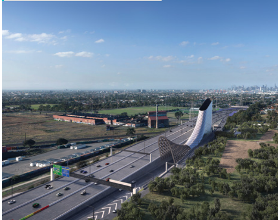
Artist's impression of the southern tunnel exit, near Millers Road on the West Gate Freeway

The combination of the structure, as well as the powerful jet fans, will ensure that safe air quality is maintained both inside and outside the tunnel.