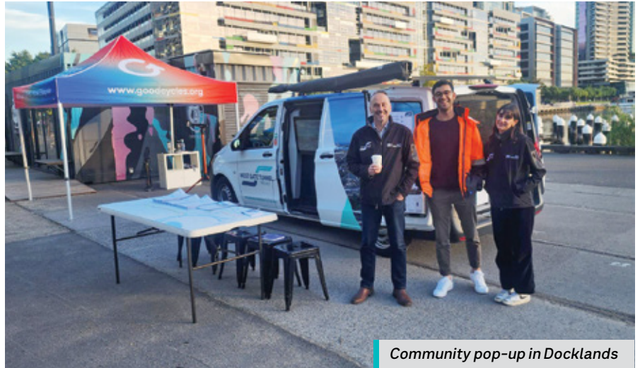
Community pop-up in Docklands

Our Info Centre is open Monday to Saturday at 2 Somerville Road Yarraville.