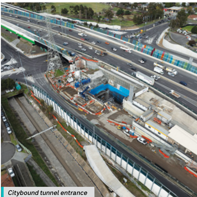
Citybound tunnel entrance

Once complete, the citybound tunnel portal timber net structure will soar approximately 30 metres into the air, creating a striking, architectural addition to the West Gate Freeway.