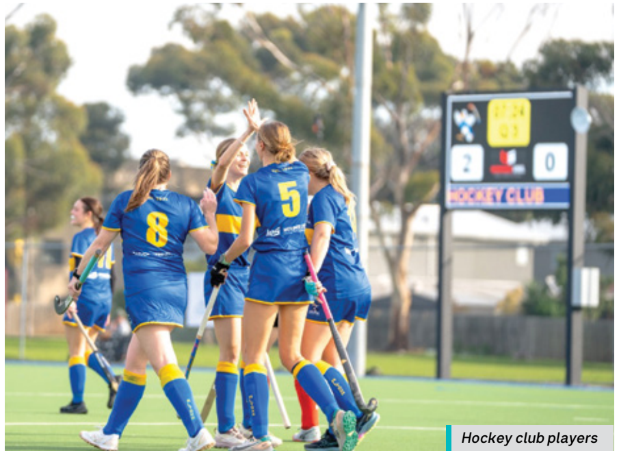
Hockey club players