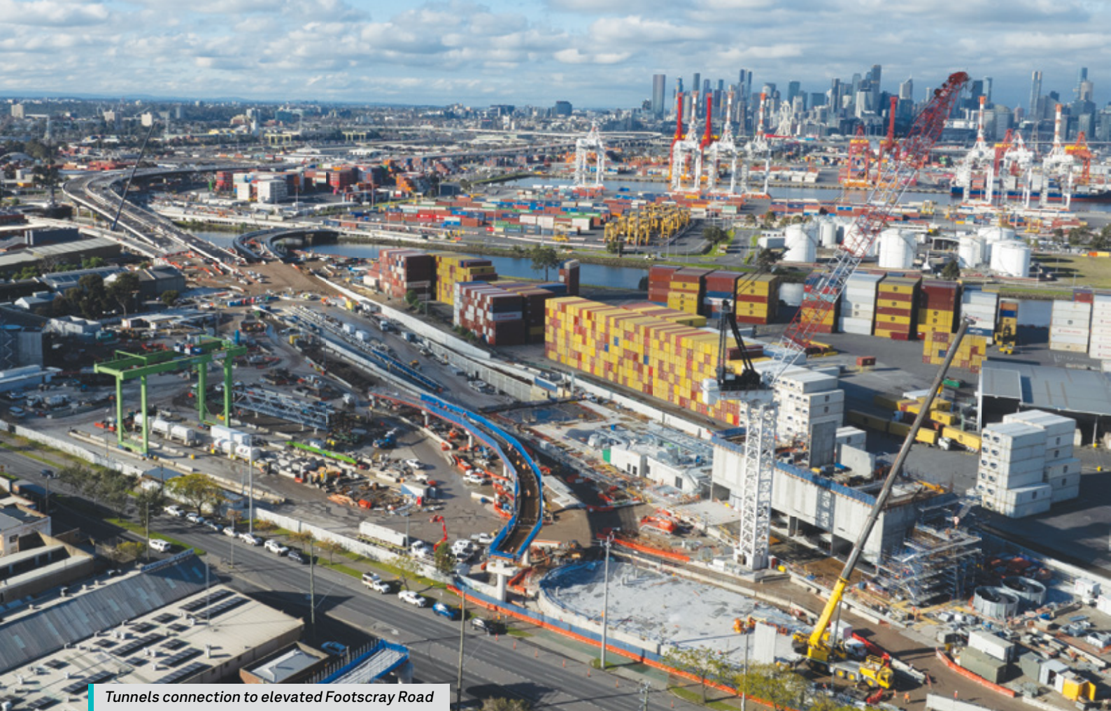
Tunnels connection to elevated Footscray Road