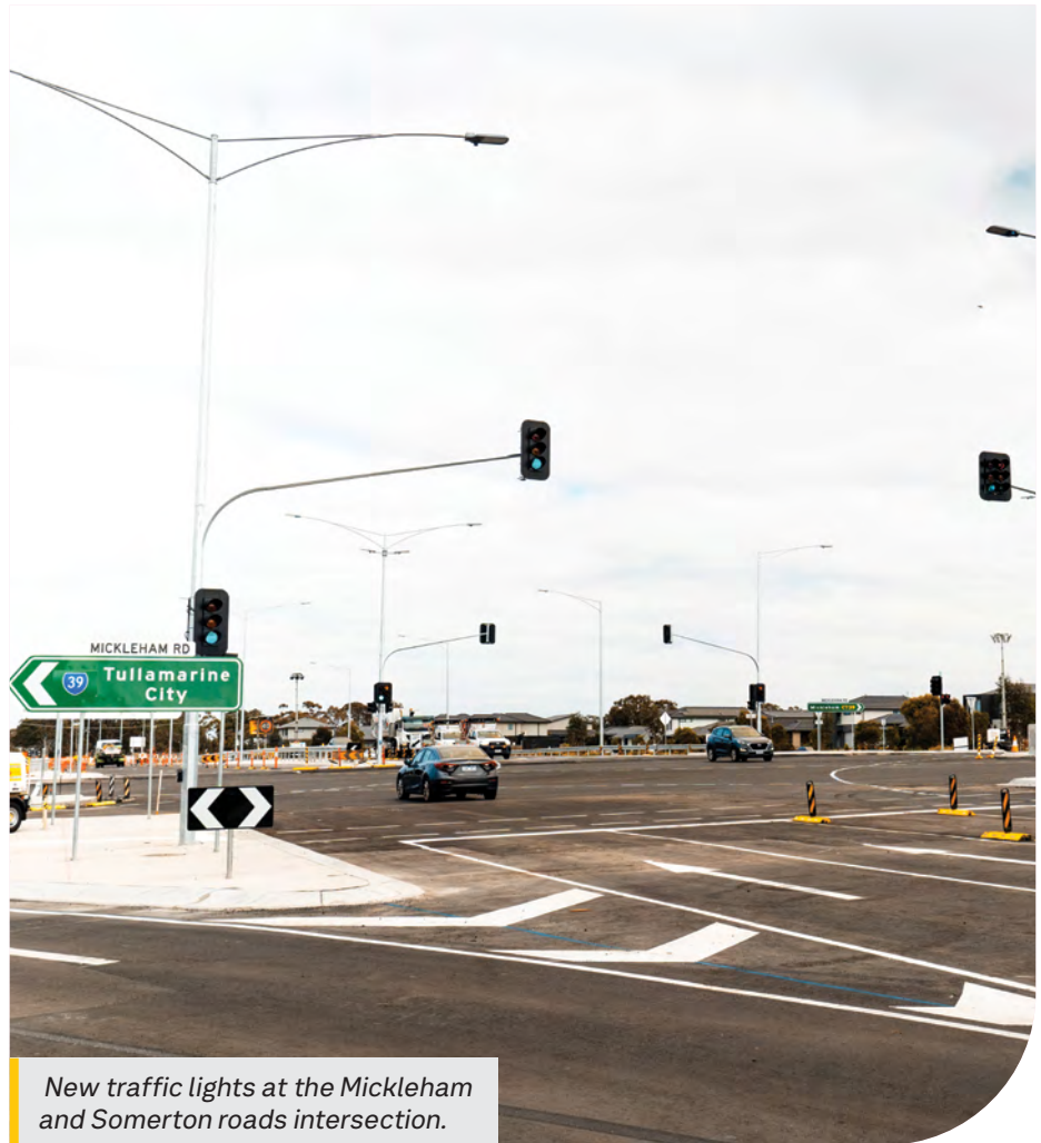
New traffic lights at the Mickleham and Somerton roads intersection.

Even though the intersection is now fully open to traffic, we'll need to continue doing some minor finishing works to ensure road users get the full benefit from the work that's been done.