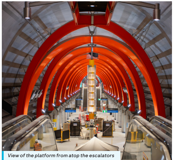
View of the platform from atop the escalators

24 hour works are sometimes required during peak construction activities