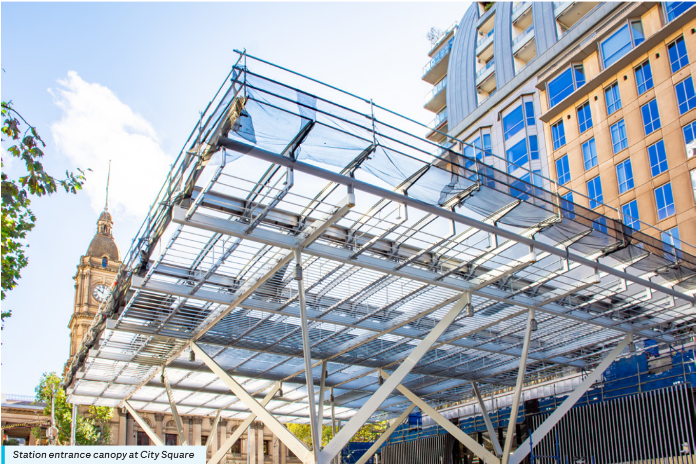
Station entrance canopy at City Square

For more information, please contact Citywide on 1300 136 234