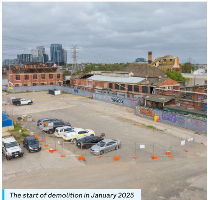
The start of demolition in January 2025

24 hour works are sometimes required during peak construction activities We will notify if out of hours works are required