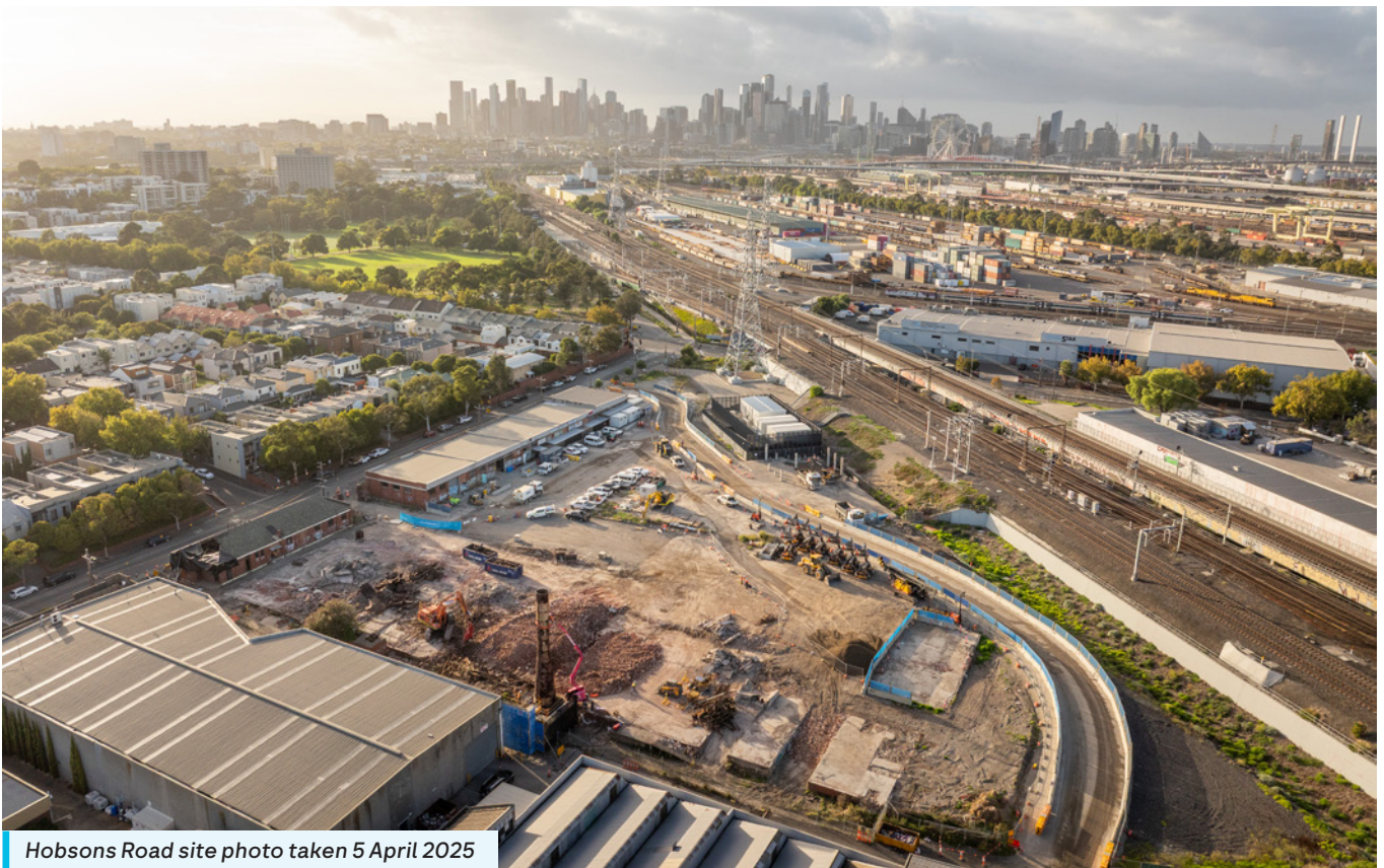
Hobsons Road site photo taken 5 April 2025

Further information on these works can be found overleaf or at metrotunnel.vic.gov.au