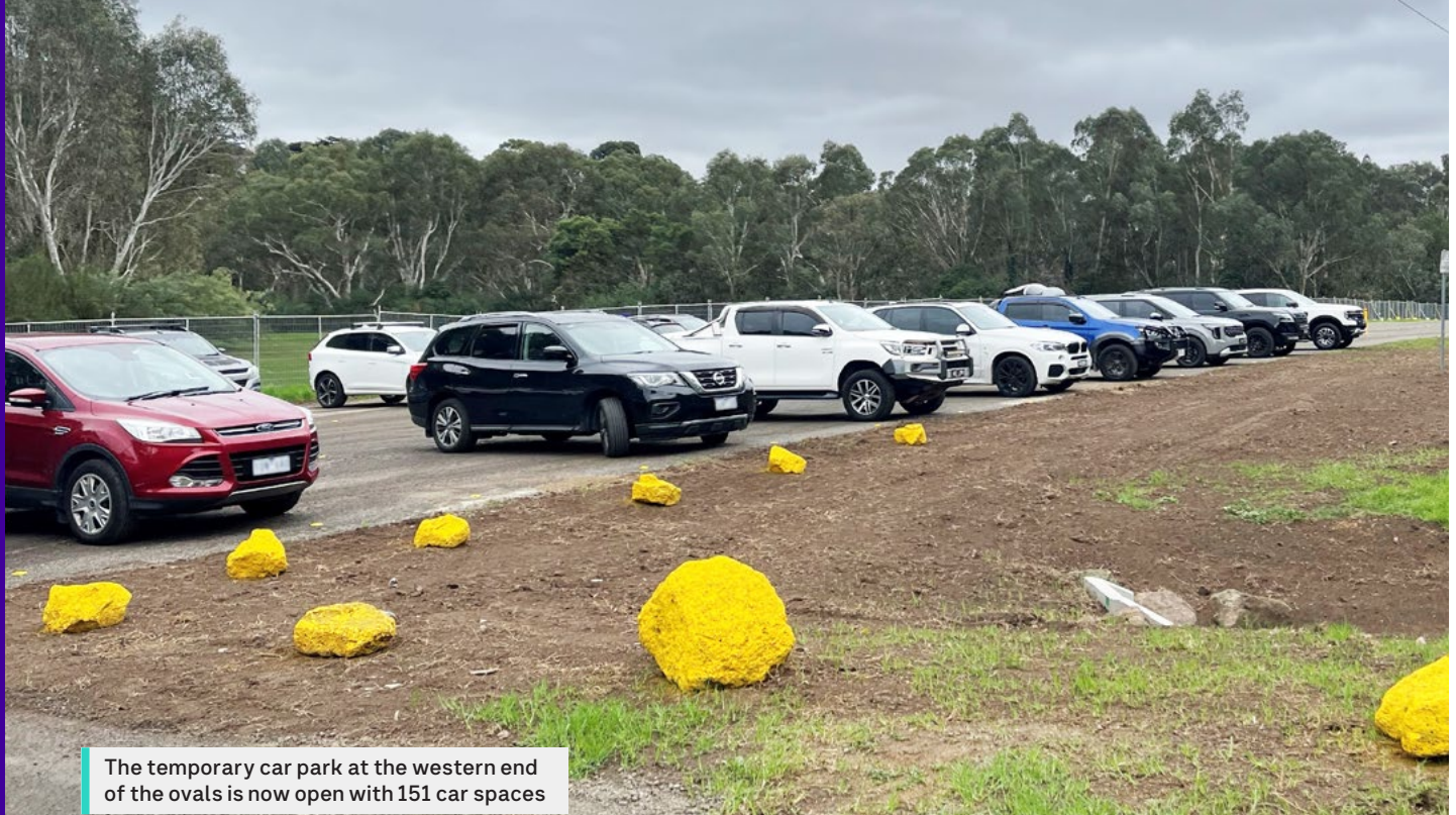
The temporary car park at the western end of the ovals is now open with 151 car spaces