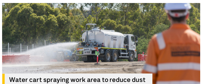
Water cart spraying work area to reduce dust