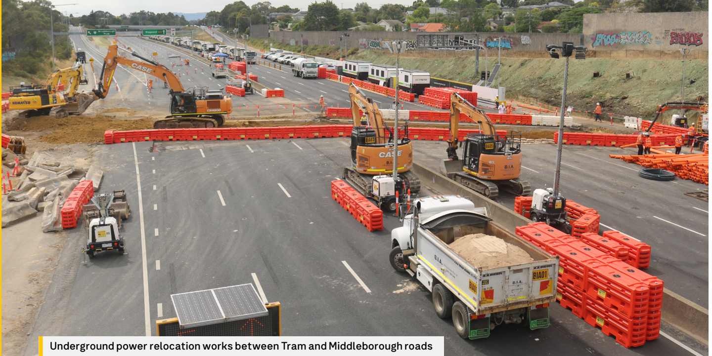
Underground power relocation works between Tram and Middleborough roads