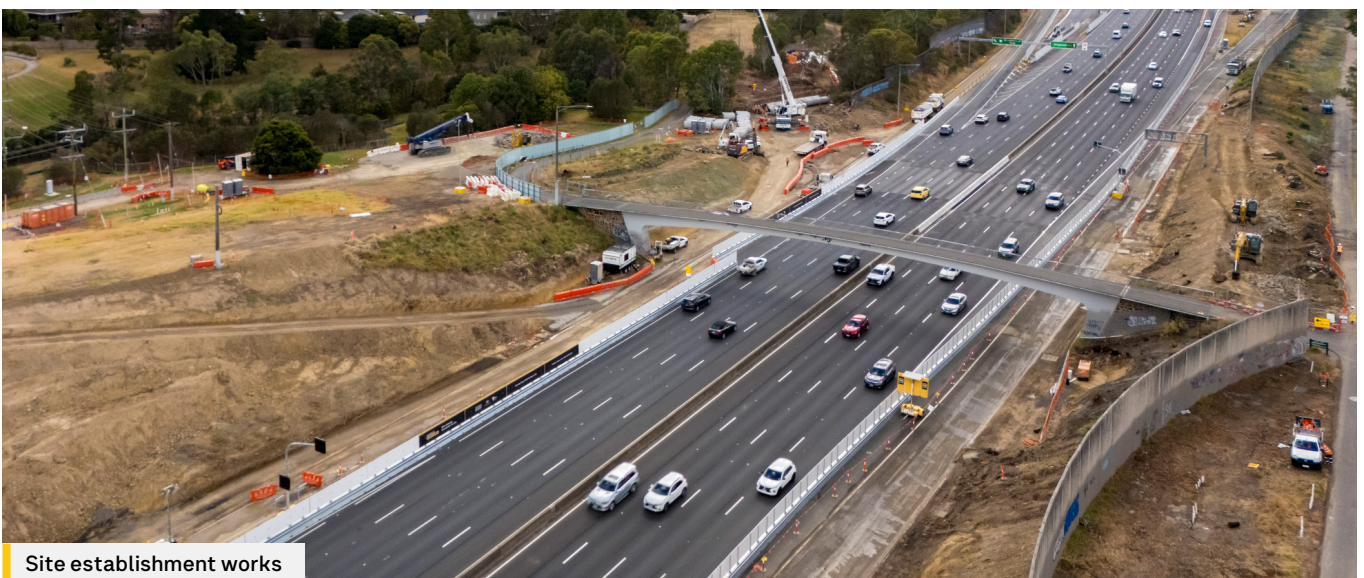
Site establishment works