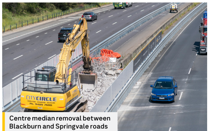
Centre median removal between Blackburn and Springvale roads

We've built temporary noise walls and started to remove existing noise walls to make space for future freeway widening works. We'll soon start works to relocate a sewer between the pedestrian bridge and Middleborough Road.