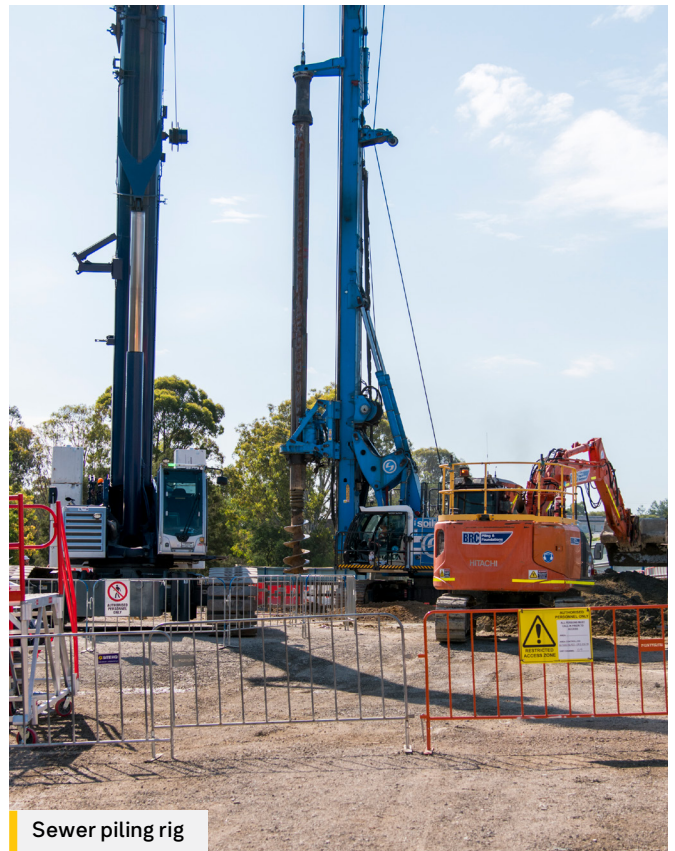
Sewer piling rig

We'd like to thank the community for their patience during these important works.