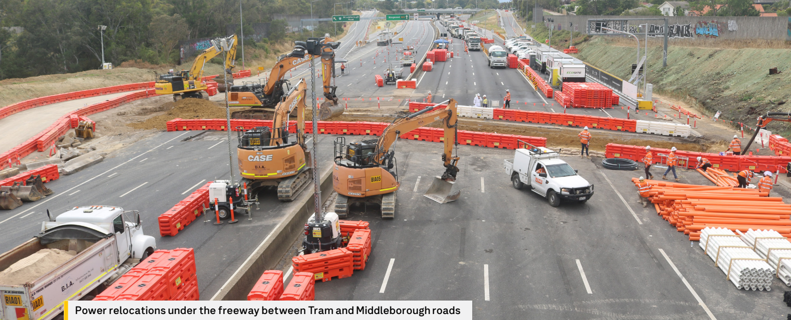
Power relocations under the freeway between Tram and Middleborough roads