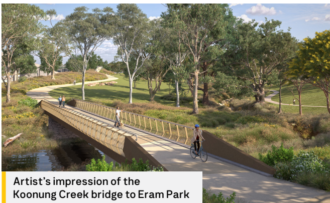
Artist's impression of the Koonung Creek bridge to Eram Park

While stocks last, residents near Eastern Freeway construction areas in Blackburn North, Box Hill North, Doncaster, Doncaster East, Donvale and Nunawading can register for free trees. Apply before 29 March 2026. To register visit bigbuild.vic.gov.au/greener-north-east .