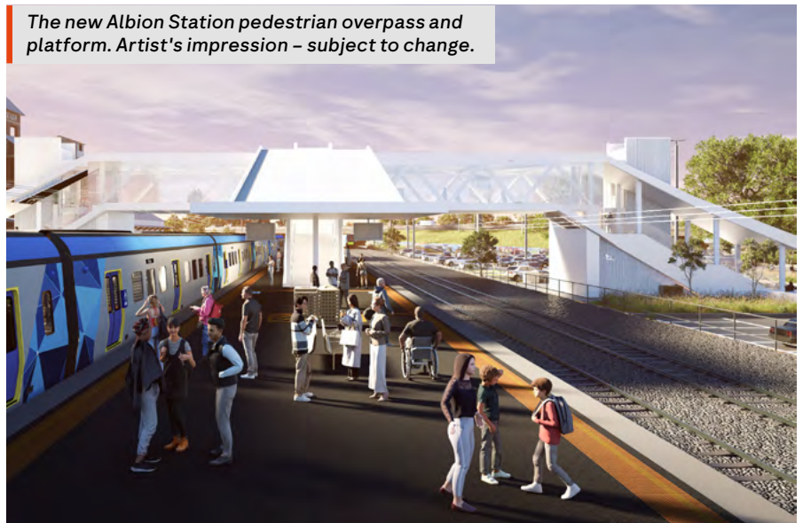
The new Albion Station pedestrian overpass and platform. Artist's impression – subject to change.

New pedestrian paths to the station on both sides of the rail line