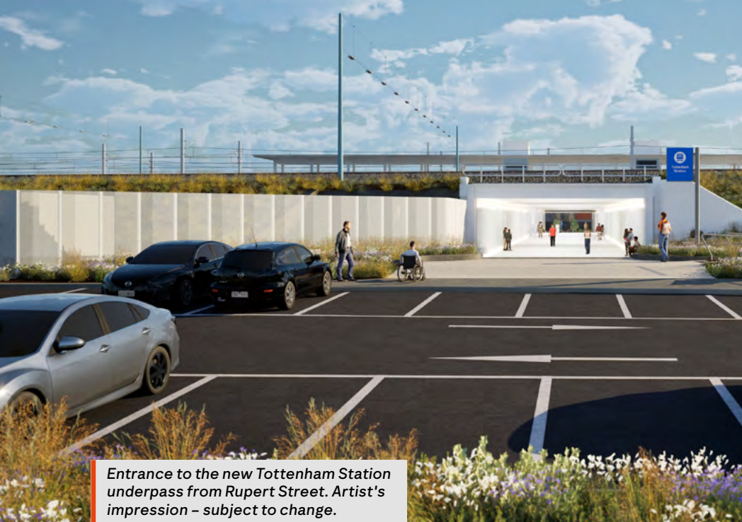
Entrance to the new Tottenham Station underpass from Rupert Street. Artist's impression – subject to change.