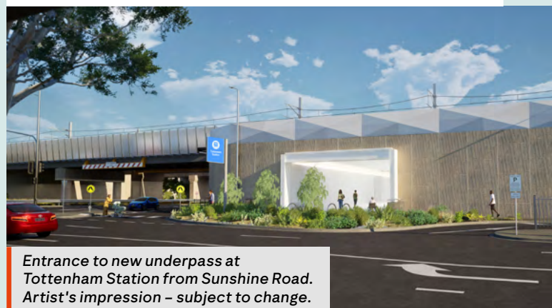
Entrance to new underpass at Tottenham Station from Sunshine Road. Artist's impression – subject to change.

Separate planning consultation for Albion Station will take place later this year.