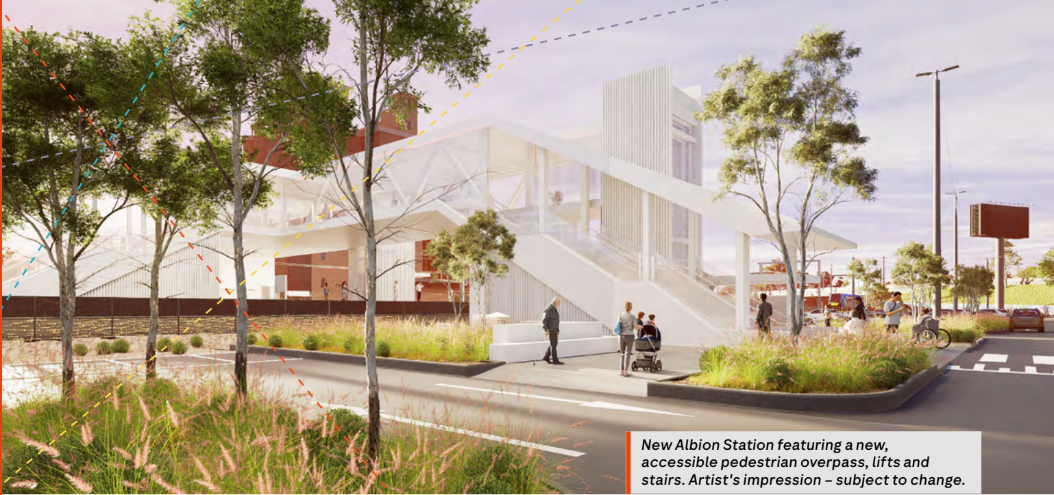
New Albion Station featuring a new, accessible pedestrian overpass, lifts and stairs. Artist's impression – subject to change.