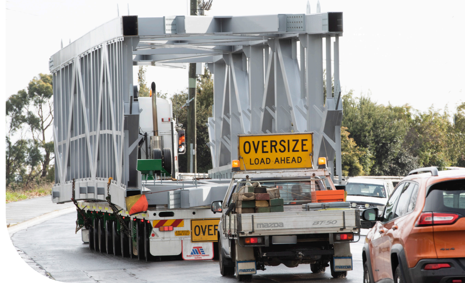
The Muir Street pedestrian overpass truss is transported as an oversized load.

If you're travelling behind one of these bigger loads and want to overtake, please do so safely and with care.