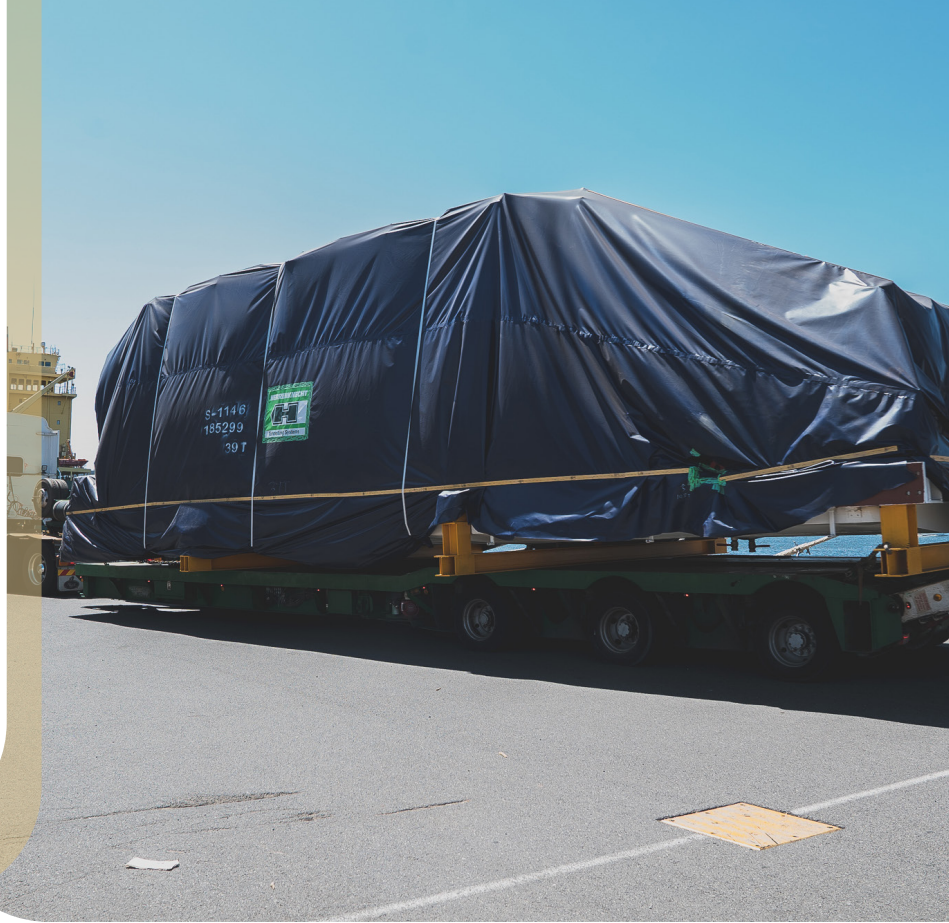
Our Tunnel Boring Machine, Bella's main drive being transported from Port of Melbourne to the Northern Portal in Yarraville.

For more information about these deliveries to site visit our website westgatetunnelproject.vic.gov.au/benalladeliveries or call us on 1800 105 105.