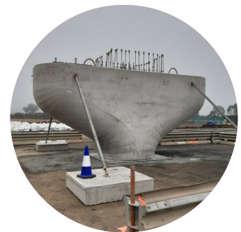
Crosshead for Footscray Road elevated road