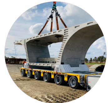
A span for the new elevated road

A large amount of planning goes into how these pieces are best moved in order to reduce the disruption to motorists and nearby local communities. This includes minimising as much as possible the number of loads that detour off main roads, travelling at low speed, having pilot vehicles guide the trucks and informing communities of what to expect.