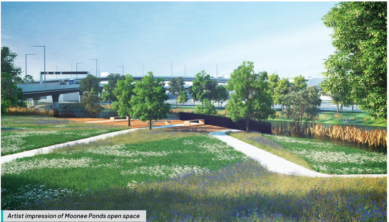
Artist impression of Moonee Ponds open space