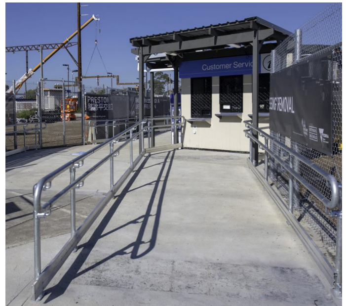
Temporary station facilities at Preston Station

The Mernda line has unique constraints as it cannot close for longer than 12 consecutive days due to a requirement for trains to regularly access the Epping maintenance yard. With this in mind, the project team has developed five stages of construction to minimise disruption to the rail line.