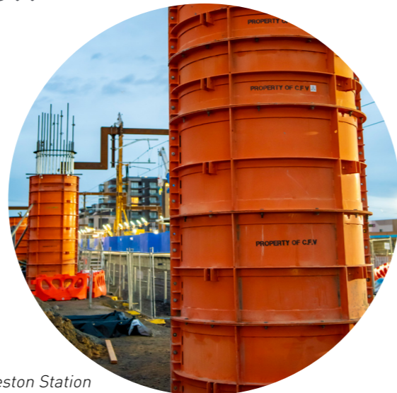
Pier construction south of Preston Station

We will build about 50 per cent of the new Bell Station and 25 per cent of the new Preston Station during this stage.