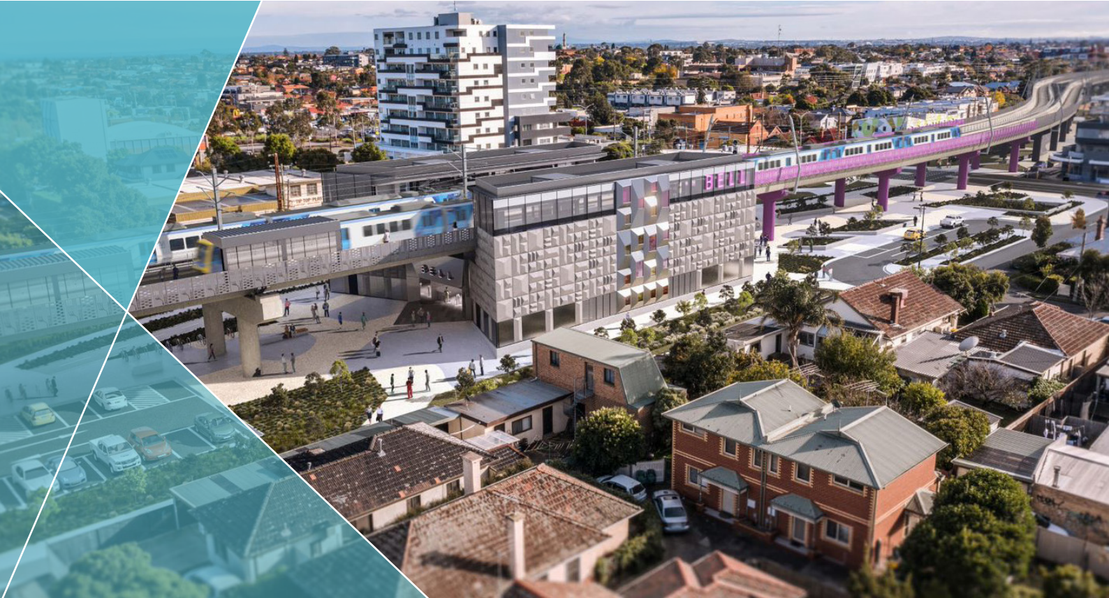
Artist's impression of the new Bell Station, subject to change

We are removing the level crossings at Oakover Road, Bell Street, Cramer Street and Murray Road in Preston.