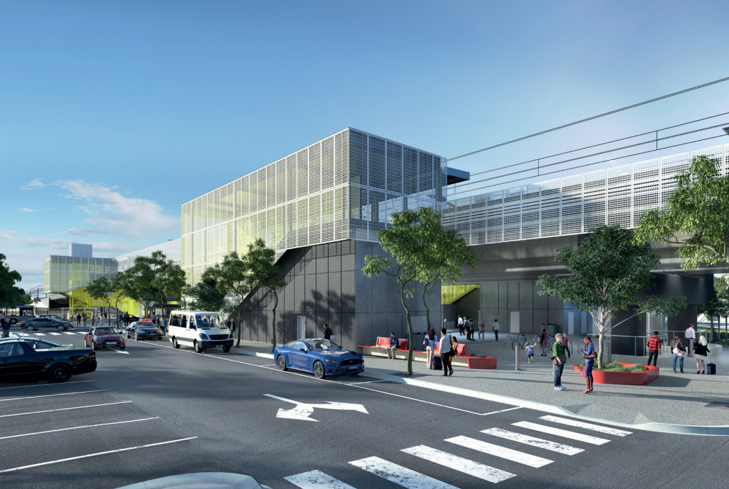
Artist's impression only. Subject to change.