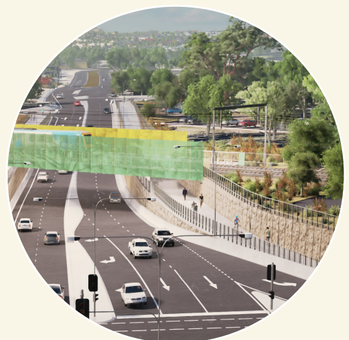
Artist's impression - subject to change