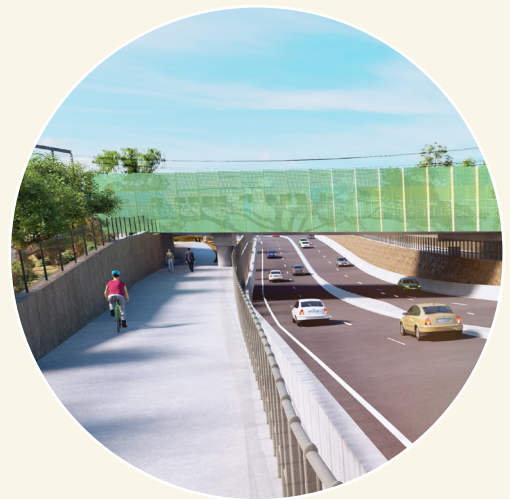
Artist's impression - subject to change

Relocating services during May Pakenham line closure.