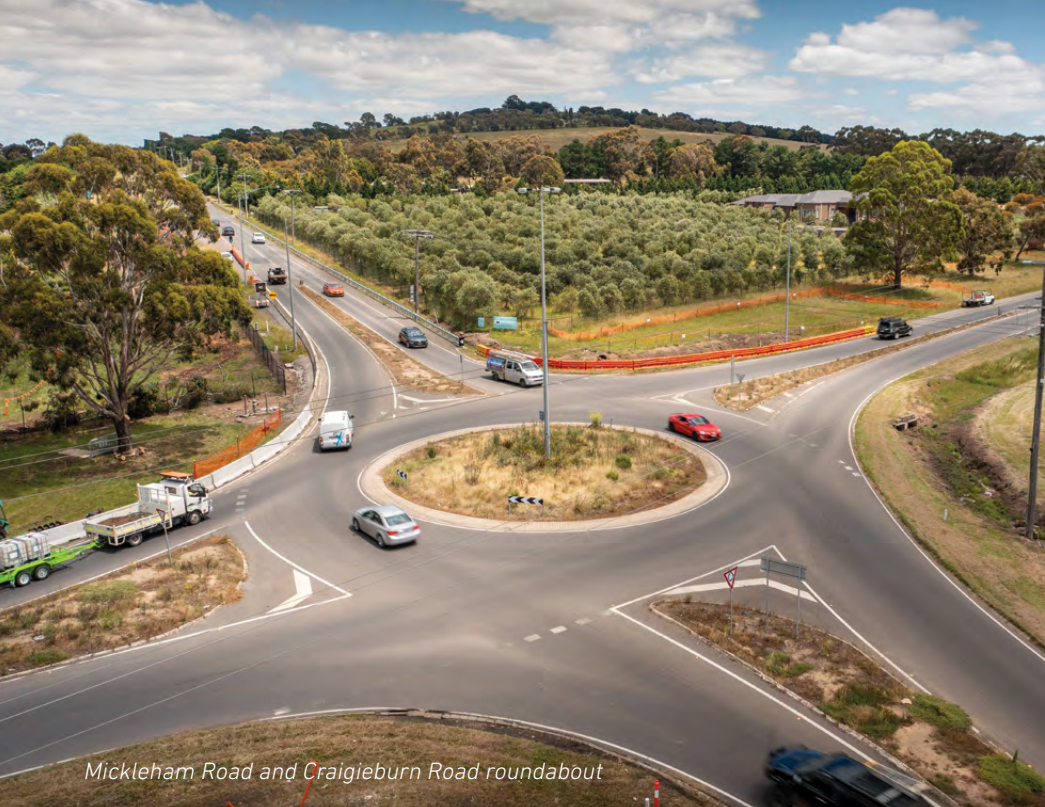
Mickleham Road and Craigieburn Road roundabout