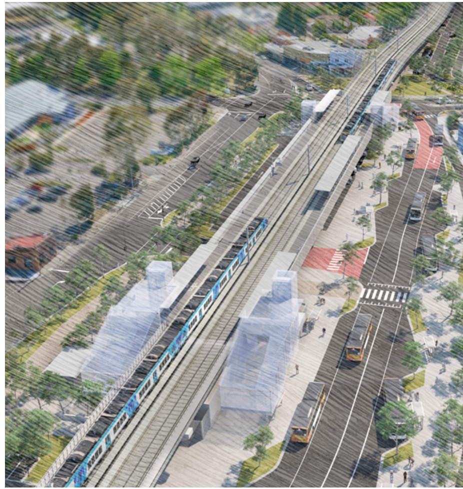
Aerial view of the new Croydon transport hub. Artist impression only. Subject to change.

Scan the QR code to see an animated map of the new road connections for Croydon.