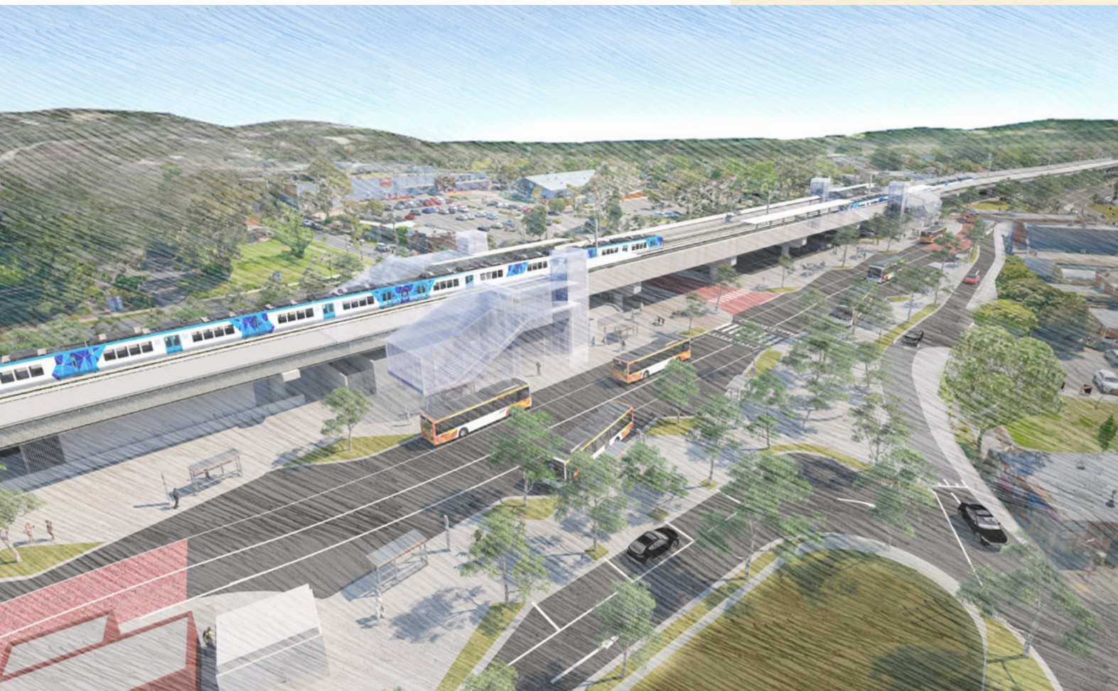
An aerial view of the transport hub, with new station and bus interchange. Artist impression only. Subject to change

To improve safety and make catching your bus easier, we're building a bus interchange to better connect with the station and trader precinct.