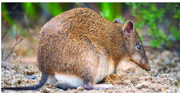
The threatened Southern Brown Bandicoot

The bait being used is Para Amino Propiophenone (PAPP). PAPP is approved by the Australian Pesticides and Veterinary Medicines Authority (APVMA) to manage pests in Victoria.