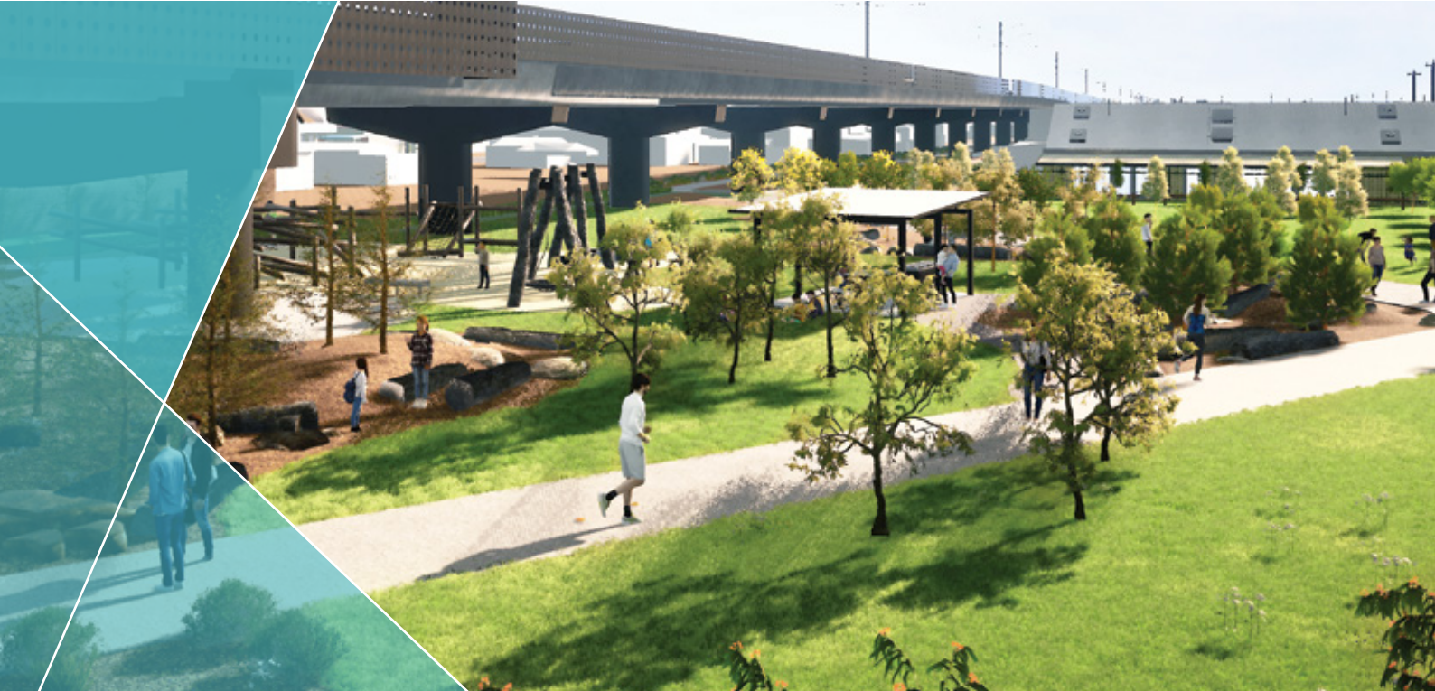
Moreland Station Reserve, day 1 | artist impressions only

The Victorian Government is removing the dangerous and congested level crossings at Bell Street, Reynard Street and Munro Street in Coburg, and Moreland Road in Brunswick.