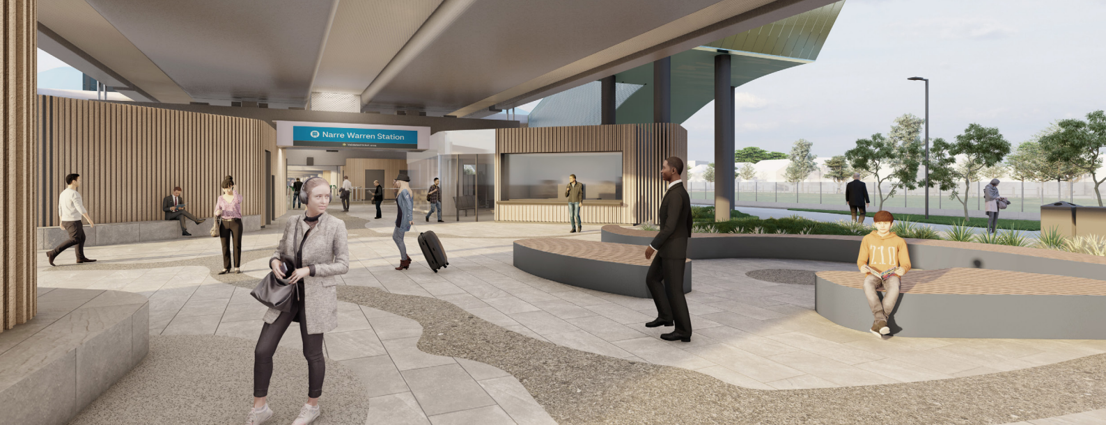
Western entrance at the new Narre Warren Station. Artist impression only, subject to change.