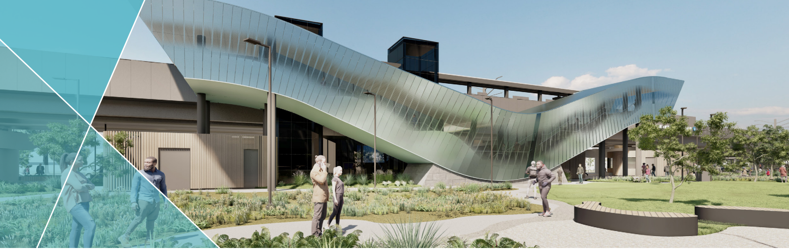
New Narre Warren Station entry, north of the rail line. Artist impression only, subject to change.