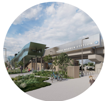
Artist impression only, subject to change.

The Level Crossing Removal Project acknowledges that we are visitors on Bunurong Country. We recognise the Bunurong's cultural and spiritual connection to the land, waterways and sky. We honour and pay respects to their Ancestors, and Elders past, present and emerging.